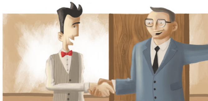
You give your tithing to a member of your bishopric or branch presidency or submit it online at donations.lds.org .