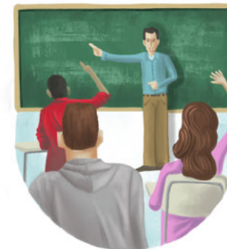
Operating Church-education programs