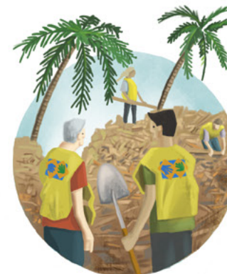
Providing welfare and humanitarian efforts