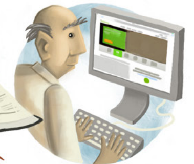
Doing family history research