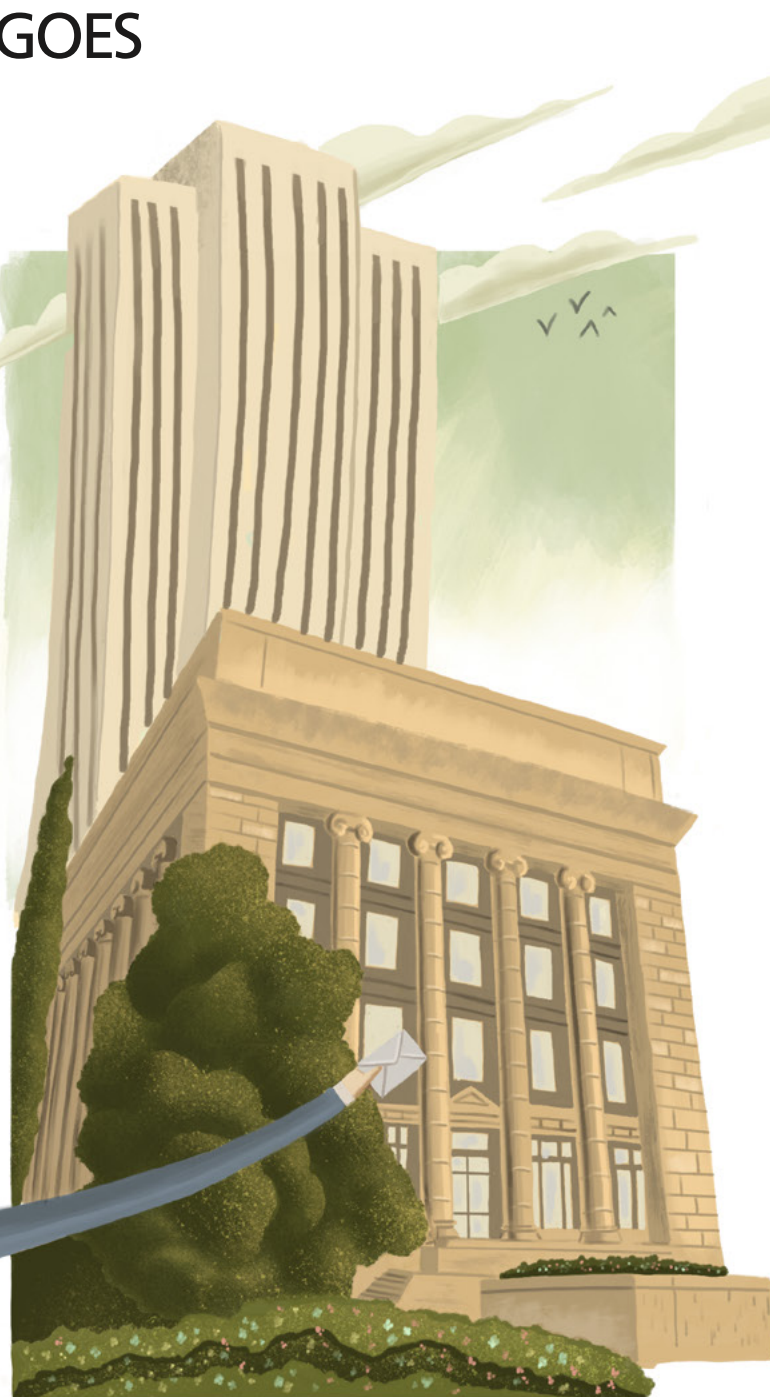
At Church headquarters, the First Presidency, Quorum of the Twelve Apostles, and Presiding Bishopric are the Council on the Disposition of the Tithes (see Doctrine and Covenants 120). As directed by the Lord, they make inspired decisions on how these sacred tithing funds will be used.