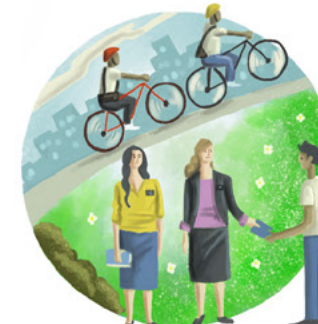
Doing missionary work