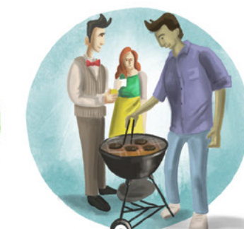
Providing Church activities for fellowshipping among ward or branch members