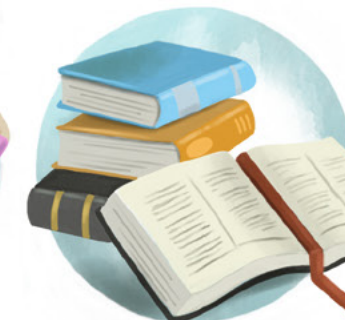
Printing scriptures and other materials