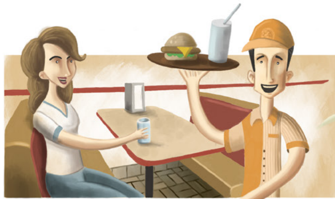
You earn money.

What happens to the money you pay for tithing?