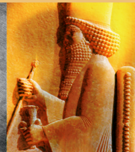
LEFT: THE PROPHET ISAIAH FORETELLS CHRIST'S BIRTH; RIGHT: JEWS IN EXILE—NEBUCHADNEZZAR'S PALACE; BABYLON ; IMAGE OF FLAMES ; IMAGE OF CYRUS THE GREAT ; DARIUS I, BAS-RELIEF ON APADANA, PERSEPOLIS, IMAGE OF GREEK COLUMN ; IMAGE OF COIN WITH PORTRAIT OF SOTER PTOLEMAIOS I

overcome the traditions and beliefs that had developed and intensified during the intertestamental period. As we understand these 500 years and the confusion that accompanied them, we can understand more about the Savior's ministry and renew our commitment to follow Him.