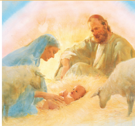
DURING THE RULE OF CAESAR AUGUSTUS AND HEROD THE GREAT, THE SAVIOR JESUS CHRIST WAS BORN IN BETHLEHEM. HE WAS BORN KING OF KINGS AND LORD OF LORDS (SEE ISAIAH 44:6).

So many expectations had built up among the different groups during the intertestamental period that the groups did not know how to recognize the true Messiah when He came to them. None of the groups—scribes, Pharisees, Essenes, or Sadducees—accepted John the Baptist as a prophet or Jesus as the Messiah. Some members of these groups became the primary adversaries of John and Jesus during their ministries (see Matthew 21:23–46).