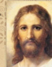
CHRIST'S IMAGE BY HEINRICH HOFMANN, COURTESY OF C. HARRISON CONROY CO.

“Come unto me, all ye that labour and are heavy laden, and I will give you rest.