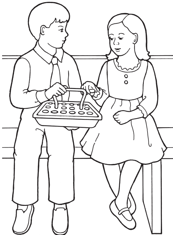
I can think of Jesus when I drink the water.