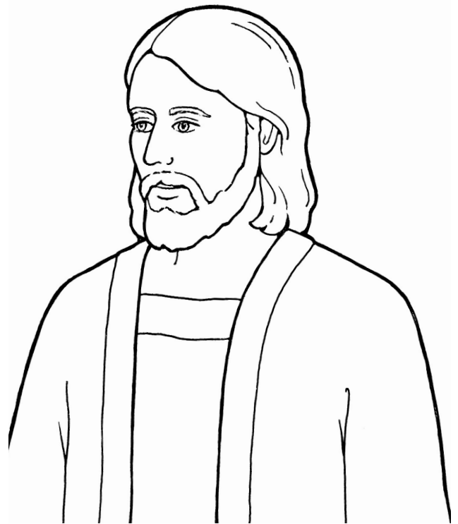
The sacrament helps me think about Jesus.