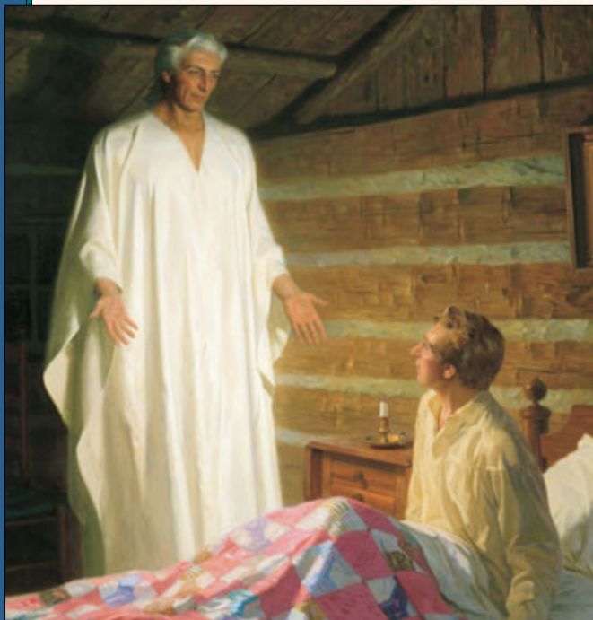
Teen saal baad Joseph Smith ki Pehli divydrishti ke baad, Bhagwaan ne dut Moroni ko Joseph ke paas Ishu Masiha ke baremein batlane ke liye bheja.

Kyunki Joseph yeh aswikaar karne se inkaar raha the ki usne Bhagwaan ko dekha hai, uske khilaaf atyachaar aur badthe chala gaya. September 21, 1823 mein, bistar par jaane se pehle usne prarthna ki, yeh jaanne ke liye ki Prabhu unke bare mein