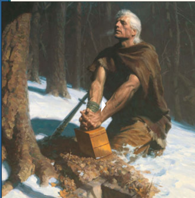
A.D. 421 mein Bhavishyevakta Moroni ne apne logon ke pavitra itihaas ko Hill Cumorah mein dafnaya the. Baad mein ji uthne purush ki sthithi mein unhonne Joesph Smith ko is itihaas ke bare mein batlaya, jisme pura susamachaar mavjood hai, usi tarah jaise Masiha ne American jile ke logon ko diya tha. Yeh itihaas, Mormon ki Pustak hai.

M ujhe ye sab batane ke baad Moroni ne purv vidhaan ki kuch bhavishyevaani batai. Unhonne, pehle Malachi ke teesre adhyaye ko dahoraya; aur unhonne usi