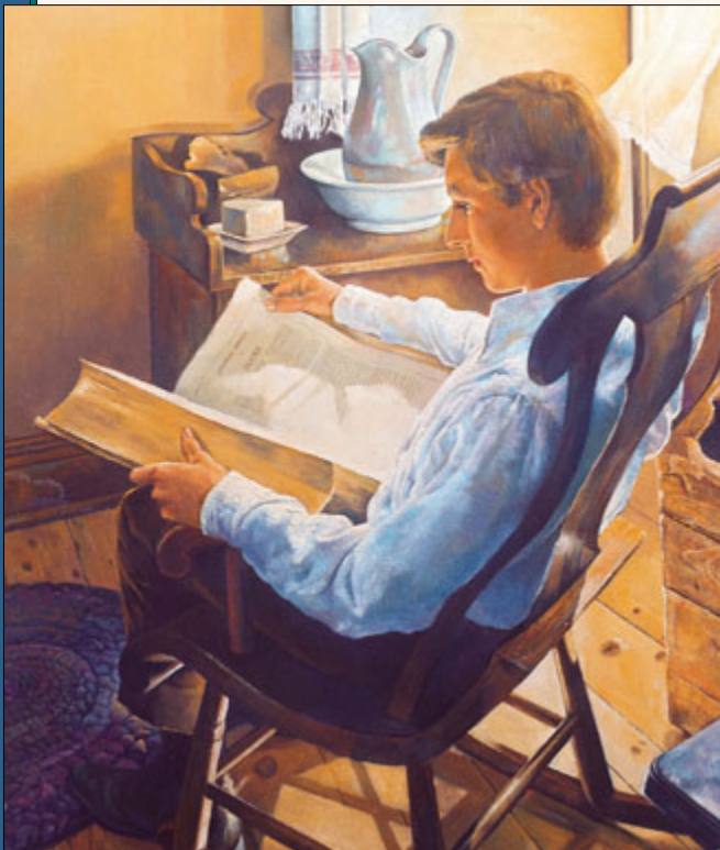
Jab Joseph ne vichaar kiya ke kaun sa girjaghar jaye, tab us ne Bible ke adhyaye se madad li. Jahan us ne padha, "Bhagwaan se maango."

Usi din se, Joseph ne Bhagwaan ka kaarye shuru kar diya, Ishu Masiha ka Girja-antim dinon ke santan ke, aur Bhagwaan ka rajye jo dharti par hoga antim-dinon mein use banane se. Girja ke vishwaaskaari membran yeh gawahi dete hain ki, Ishu Masiha hi is duniya ke masiha aur muktidaata