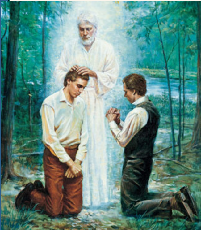
John the Baptist dwara sar par haath rakh kar Joseph Smith aur Oliver Cowdery ko 15 May, 1829 mein Aaronic Purohiti mili.

"O humare shishye, Masiha ke naam se, mein app ko Aaron ki Purohiti ka ashirvaad deta