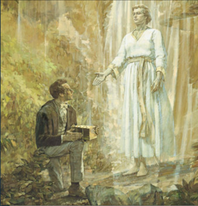
Moroni chaar saalon mein, har saal javaan bhavishyevakta ko adesh dene aate the. Un chaar saalon ke baad Joseph ko patte mile aur unhone Mormon ki Pustak ka anuwaad shuru kar diya.

Ahista se main apne palang, se utha aur phir usi, tarha apne roj ke kaam kaaj se masruf ho gaya, par, is samay mainne thode hi kiya ki