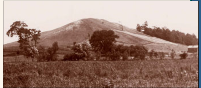
Hill Cumorah, Smith farm jo Palmyra, New York mein hai, usse teen mil dakshinpurav ki disha mein hai. Joseph ke samay, uttar ant ghaas se bhara hua tha, aur dakshin, lakdi aur jungle se. Patte dakshinpakshim ki or dafan thi, jo choti se thodidur par hai. Photograph: August 1907

Is samay tak mere mann mein itne gehri khay-alaat ho gayi thi, neend meri aankhon se udh gayi thi, aur main lete hue chakit ho kar, jo mainne suna aur dekha, uske baare mein soch raha tha. Par main phir se chakit ho gaya jab mainne usi dut ko phir se apni khaat ke paas dekha, aur unhein wahi cheezein dohraate hue suna jo unhonne pehle kah diya tha; aur