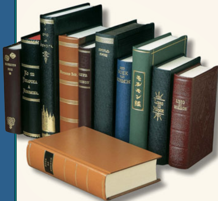
Mormon ki Pustak, jo pehle likhi gayi 1830 mein, 80 se zyaada bhaashaon mein duniya bhar mein chap chuki hai.

Pura padhne ke liye Joseph Smith's ki kahani, dekho Joseph Smith— itihaas aur Pearl of Great Price ya History of the Church, 1:2–79.