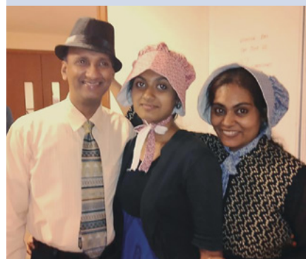
Attendees at the Pioneer Day celebration