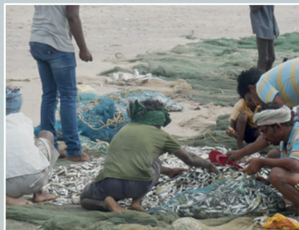
The Fishers of Fish ↑