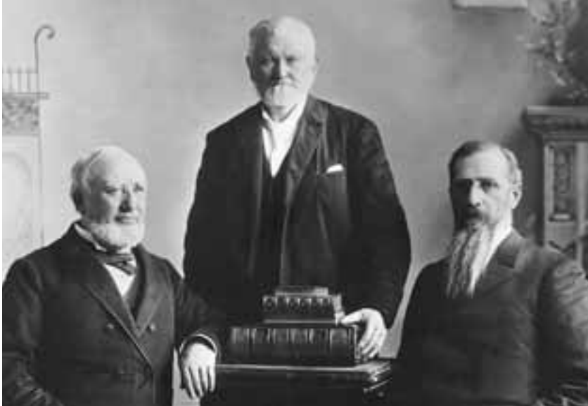
The First Presidency in 1894.

From left to right, President George Q. Cannon, First Counselor; President Wilford Woodruff; and President Joseph F. Smith, Second Counselor.