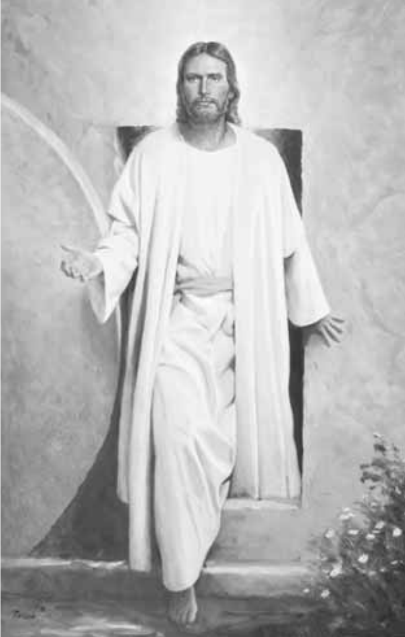
President Woodruff testified that the Savior was “the first fruit of the resurrection.”