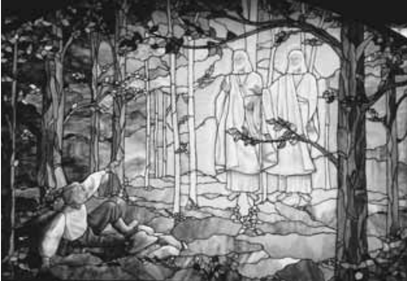
Joseph Smith was “administered unto, in answer to his prayers, by the Father and the Son.”

by the will of man, but he required the angels of God to come forth and teach him; it required the revelations of God to teach him, and he was taught for years by visions and revelations, and by holy angels sent from God out of heaven to teach and instruct him and prepare him to lay the foundation of this church.