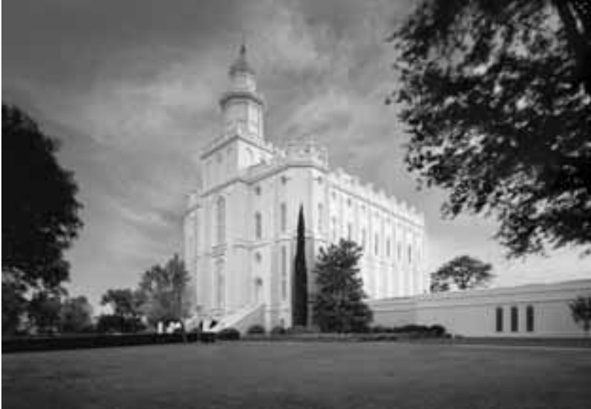
The St. George Utah Temple, where President Wilford Woodruff served as temple president.