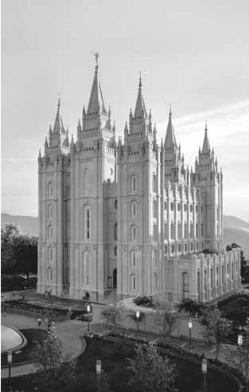
The Salt Lake Temple, dedicated by President Wilford Woodruff on April 6, 1893.