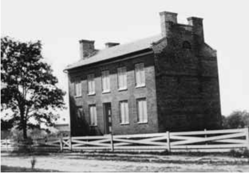
Elder Wilford Woodruff and his family lived in this home in Nauvoo, Illinois.

emigration: their journey across the plains and mountains of the United States to their promised land in the Salt Lake Valley. As part of the first company of pioneers, he transported President Brigham Young, who was ill, the last part of the journey. Elder Woodruff was present when President Young rose from his bed in the wagon, surveyed the land before them, and proclaimed: "It is enough. This is the right place. Drive on." 27