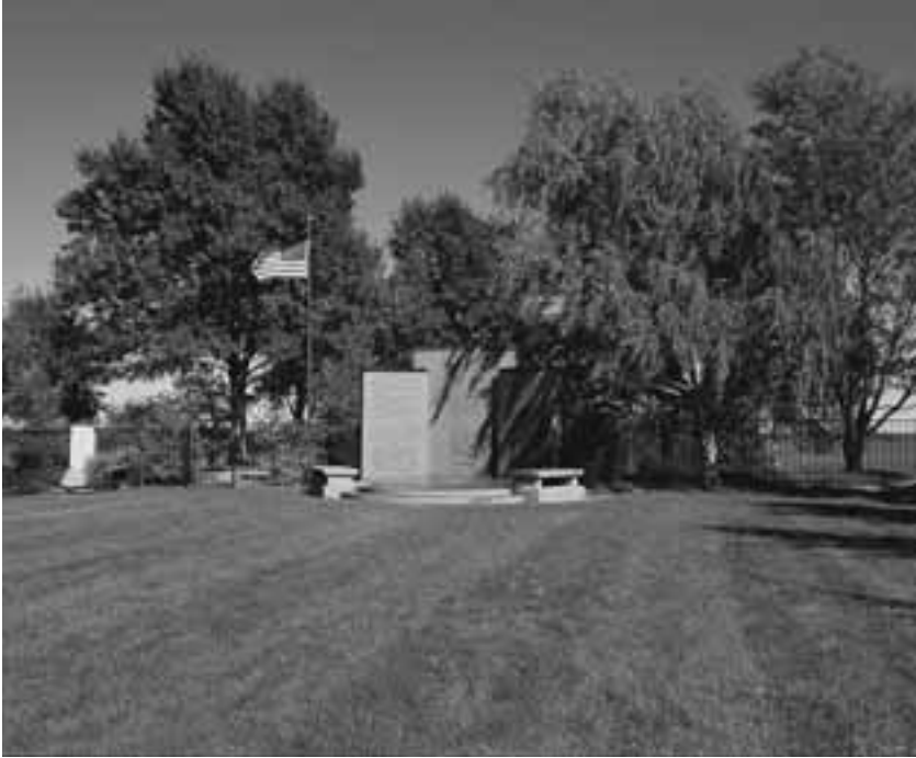
The temple site in Far West, Missouri, where members of the Quorum of the Twelve met on April 26, 1839, in obedience to the Lord's command.

the governor, and though the Prophet Joseph and his brother, Hyrum Smith, with other leading men were in the hands of our enemies, in chains and in prison, we moved on to the temple ground in the city of Far West, and held a council, and fulfilled the revelation and commandment given unto us, and we performed many other things at this council. . . .