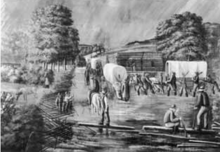
Referring to Zion's Camp, President Woodruff said, "We gained an experience that we never could have gained in any other way."