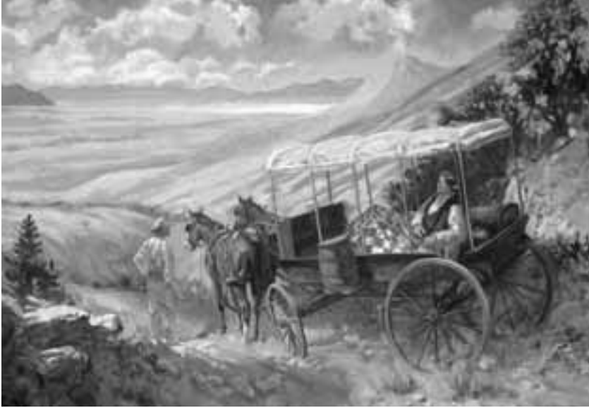
On July 24, 1847, President Brigham Young arose from his bed in Wilford Woodruff's wagon and said: "It is enough. This is the right place. Drive on."

planted them. I got them into the ground by 1 o'clock, and these, with the potatoes that the other brethren had planted, became the foundation for the future potato crops of Utah.