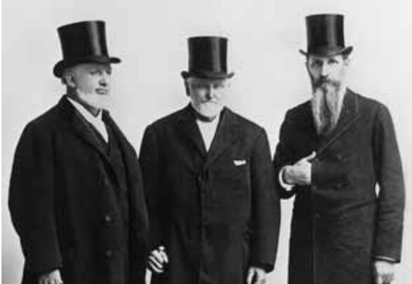
President Wilford Woodruff, center, with his counselors in the First Presidency: Presidents George Q. Cannon, left, and Joseph F. Smith, right.

the God of Heaven. I ask this blessing of my Heavenly Father in the name of Jesus Christ, the Son of the Living God.” 39 President Woodruff was sustained as President of The Church of Jesus Christ of Latter-day Saints on April 7, 1889. He was the fourth President of the Church in this dispensation.