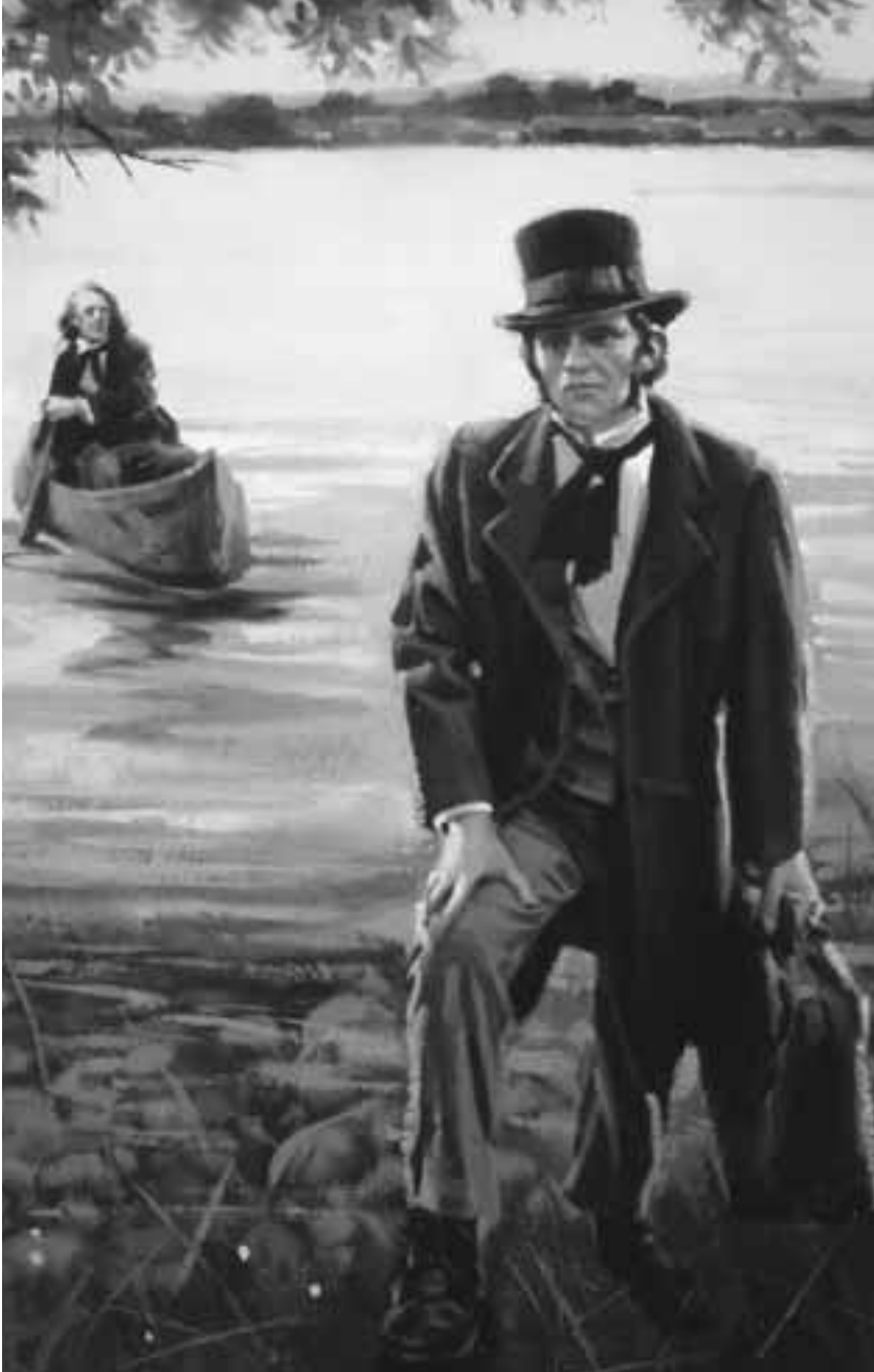
In 1839, Elder Wilford Woodruff (foreground), Elder Brigham Young (background), and other members of the Quorum of the Twelve Apostles left their homes to preach the gospel in England.