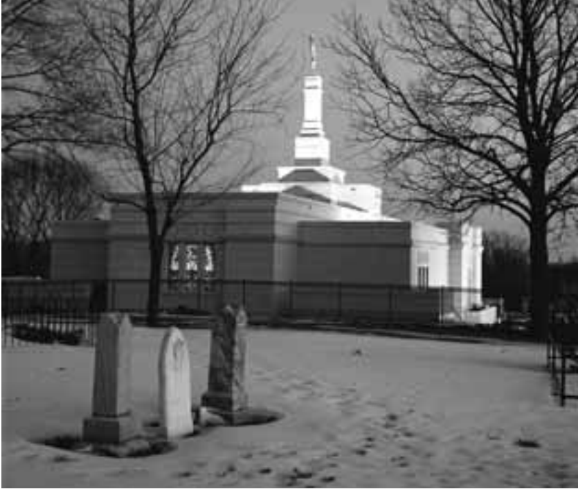
The Winter Quarters Nebraska Temple, built where many Latter-day Saints camped in the winter of 1846–47 before their trek to the Salt Lake Valley.

God is no respecter of persons; he will not give privileges to one generation and withhold them from another; and the whole human family, from father Adam down to our day, have got to have the privilege, somewhere, of hearing the gospel of Christ; and the generations that have passed and gone without hearing that gospel in its fulness, power and glory, will never be held responsible by God for not obeying it. Neither will he bring them under condemnation for rejecting a law they never saw or understood; and if they live up to the light they had they are justified so far, and they have to be preached to in the spirit world. 8