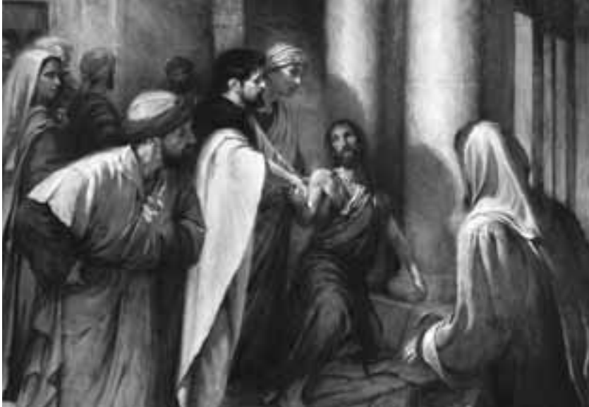
Peter and John healing a lame man (see Acts 3). Young Wilford Woodruff sought “the faith once delivered to the Saints”—a religion with the same “power before God” as the Savior’s Church in the meridian of time.

stepped into the aisle, and I said to that body of ministers: ‘My friends, will you tell me why you don’t contend for the faith once delivered to the Saints? Will you tell me why you don’t contend for that Gospel that Jesus Christ taught, and that His Apostles taught? Why do you not contend for that religion that gives unto you power before God, power to heal the sick, to make the blind to see, the lame to walk, and that gives you the Holy Ghost and those gifts and graces that have been manifest from the creation of the world? Why do you not teach the people those principles that the ancient Patriarchs and Prophets taught while they were clothed with the revelations of God? They had the administrations of angels; they had dreams and visions, and constant revelation to guide and direct them in the path in which they should walk.’