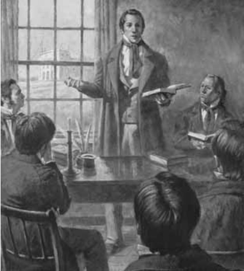
Elder Wilford Woodruff was present when the Prophet Joseph Smith gave the keys of the kingdom to the Quorum of the Twelve Apostles.

Joseph Smith was what he professed to be, a prophet of God, a seer and revelator. He laid the foundation of this church and kingdom, and lived long enough to deliver the keys of the kingdom to the elders of Israel, unto the twelve apostles. He spent the last winter of his life, some three or four months, with the quorum of the twelve, teaching them. It was not merely a few hours ministering to them the ordinances of the gospel; but he spent day after day, week after week and month after month, teaching them and a few others the things of the kingdom of God. 23