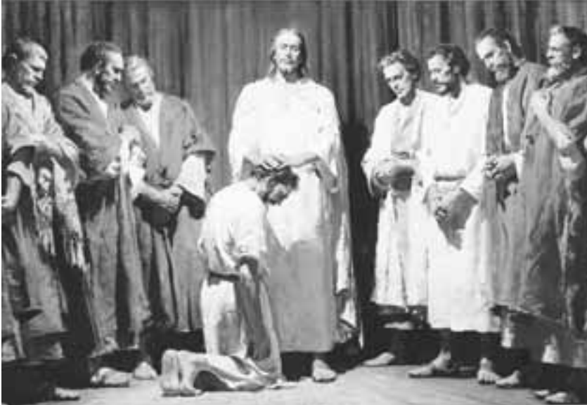
“Jesus Christ . . . brought the Gospel to the Jews and established His kingdom among them.”

not have the power to administer in one ordinance which had any force after death. They did not hold the holy Priesthood. 8