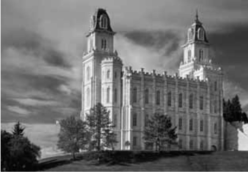
The Manti Utah Temple, dedicated by President Wilford Woodruff in 1888.

Lord an house to prepare them for the ordinances and endowments, washings and anointings, etc.” 34