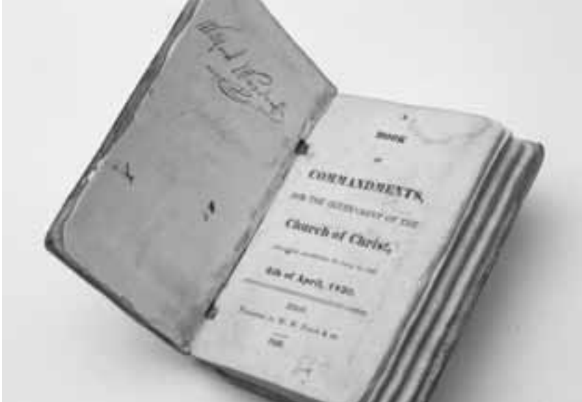
The Book of Commandments, an early compilation of revelations to Joseph Smith. This copy of the book contains Wilford Woodruff's signature.

revelation what his part and condition will be. For all men know what laws they keep, and the laws that men keep here will determine their position hereafter; they will be preserved by those laws and receive the blessings that belong to them. 20