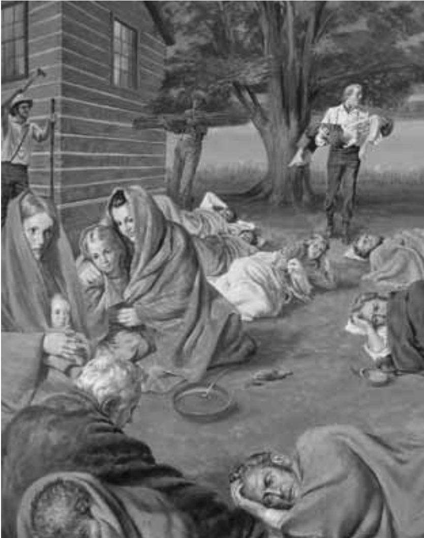
On July 22, 1839, the Prophet Joseph Smith went among the sick in Commerce, Illinois, and Montrose, Iowa, healing them by the power of the priesthood.