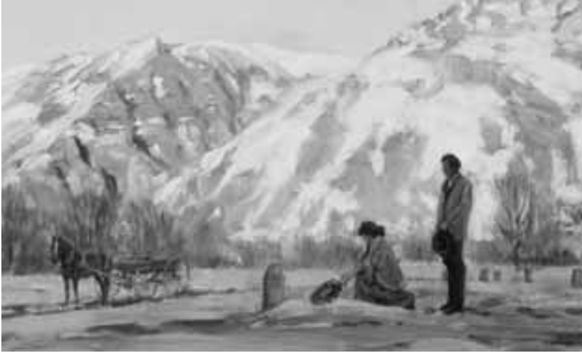
Testifying of the Savior's Atonement, President Wilford Woodruff offered comfort to parents whose little children had died.

is, they tabernacle in the flesh. They come to receive a probation and an inheritance on the earth; they obtain a body, or tabernacle, and that tabernacle will be preserved for them, and in the morning of the resurrection the spirits and bodies will be reunited, and as here we find children of various ages in a family, from the infant at the mother's breast to manhood, so will it be in the family organization in the celestial world. Our children will be restored to us as they are laid down if we, their parents, keep the faith and prove ourselves worthy to obtain eternal life; and if we do not so prove ourselves our children will still be preserved, and will inherit celestial glory. This is my view in regard to all infants who die, whether they are born to Jew or Gentile, righteous or wicked. They come from their eternal father and their eternal mother unto whom they were born in the eternal world, and they will be restored to their eternal parentage; and all parents who have received children here according to the order of God and the holy priesthood, no matter in what age they may have lived, will claim those children in the morning of the resurrection, and they will be given unto them and they will grace their family organizations in the celestial world. . . .