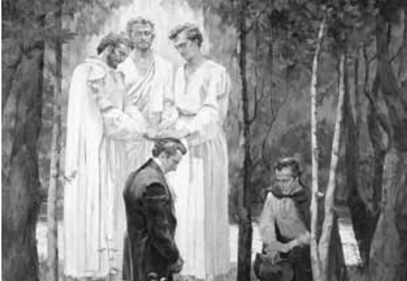
The Prophet Joseph Smith “received under the hands of Peter, James and John the apostleship, and everything belonging thereto.”

that believes.” [See Romans 1:16.] So may the Latter-day Saints say—“We are not ashamed of the gospel of Christ.” I am not ashamed to say that Joseph Smith was a prophet of God; I am not ashamed to bear record that he was called of God, and laid the foundation of this church and kingdom on the earth, for this is true, and any man or woman who is inspired by the Holy Ghost can see and understand these things.