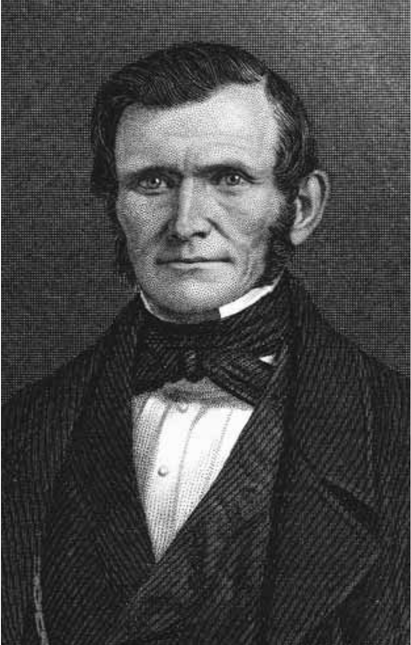
As a member of the Quorum of the Twelve Apostles, Elder Wilford Woodruff worked diligently to help establish the Church of Jesus Christ in the dispensation of the fulness of times.