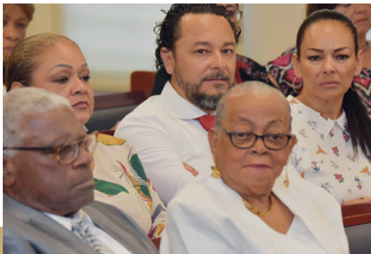
◀ Members in Curaçao