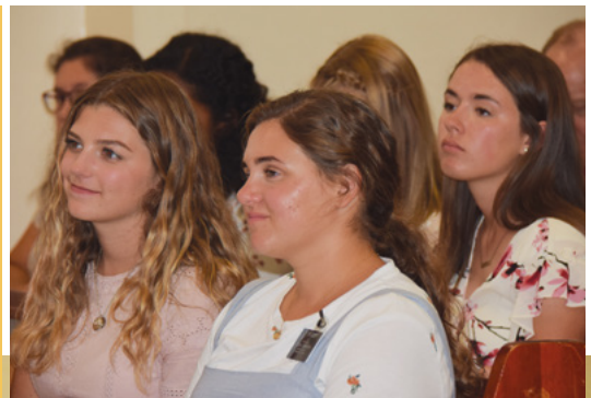
Elder Soares reminded missionaries of their purpose as missionaries. ▶