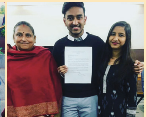
With my mom and my friend holding my mission call.

Though this conference was based on self-reliance, but we also had a lot of fun learning. If I would be asked to rate this conference on a scale of 1 to 10, I would give it a 10/10.