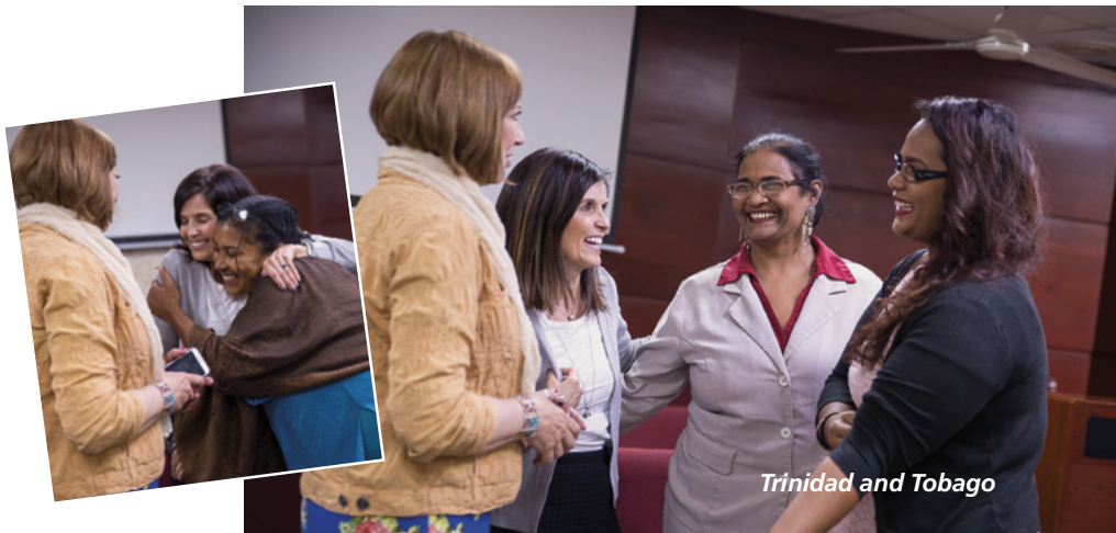
Trinidad and Tobago

The last destination of this international tour was Puerto Rico, where there are also more than 23,000 members. The interactions with the two general auxiliary leaders was a comforting time for members on the island.