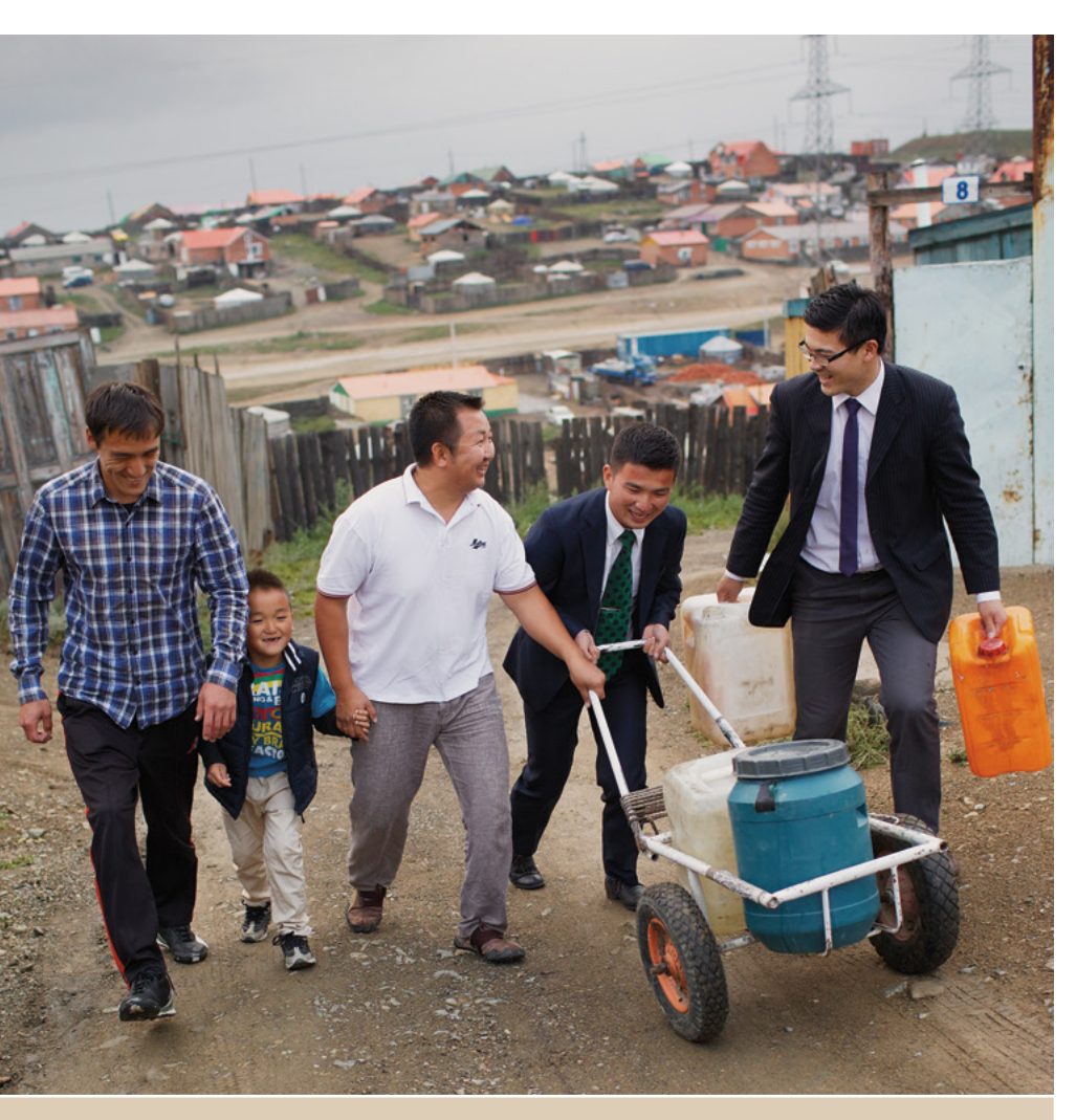
In order to return to God, we must learn to apply the gospel teachings in our lives and to love and serve one another. For this purpose, God has called us as ordinary mortals to the sacred work of His Church, so that we can learn through our ministry to come unto Christ.

who did "rejoice exceedingly to see his brethren; and what added more to his joy, they were still his