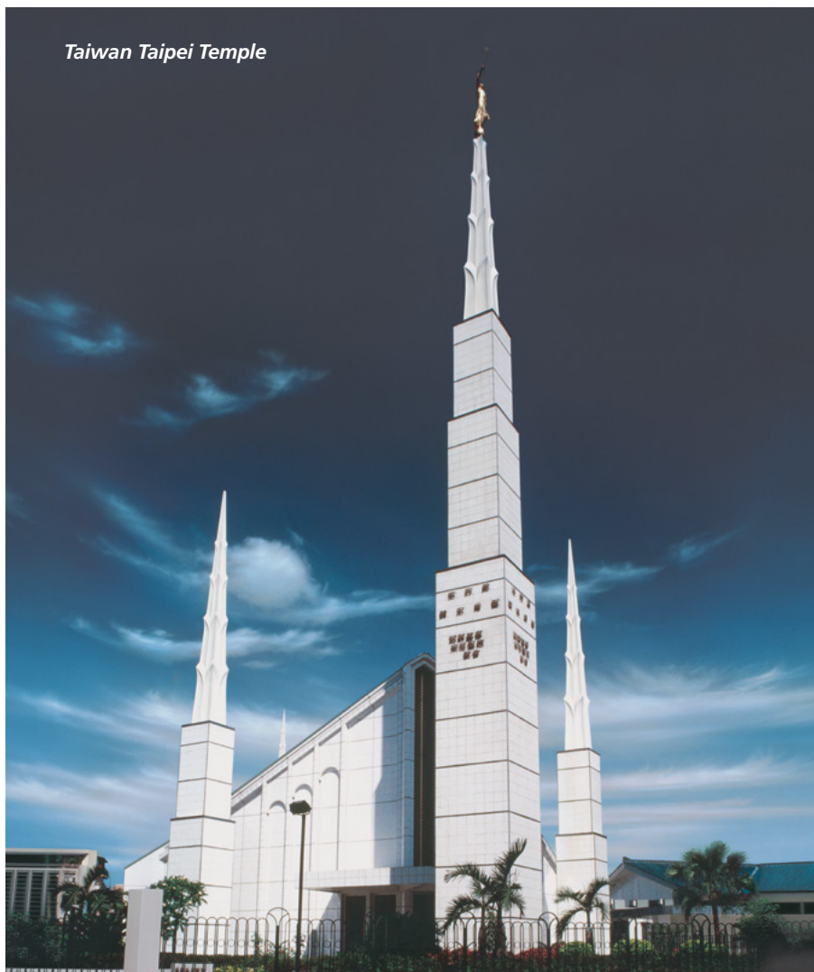
Taiwan Taipei Temple

Nearing midnight I suddenly woke up from my bed and asked my wife, “Are the missionaries teaching correct principles?” She replied that they were teaching correct principles and added more strength to it by affirming that our Heavenly Father and Jesus Christ are living. This answer made me think, and I had faith. The next morning I asked her what she said last night. She replied that she don't know because she was in a deep sleep. Then I came to know this was