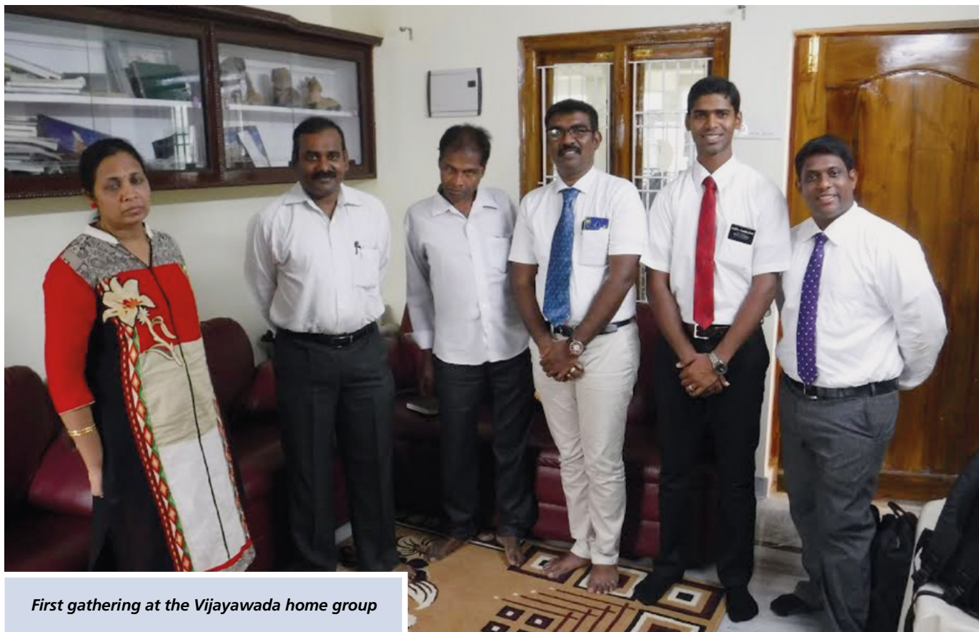
First gathering at the Vijayawada home group

Vijayawada is a city which has a lot of Christian families and churches. It was definitely not an easy task for us to work with the people. Most of the people whom we had met said, “We are already converted in Christ”. They requested us to visit the non-Christians