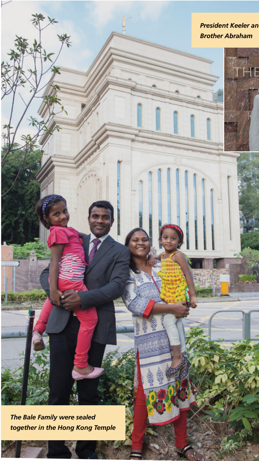
The Bale Family were sealed together in the Hong Kong Temple