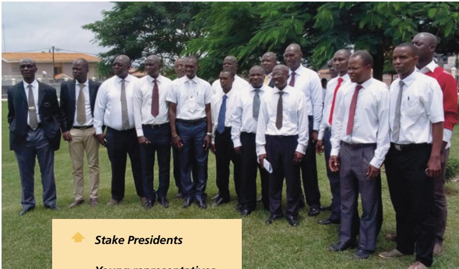
▲ Stake Presidents Young representatives ▼ from different Stakes