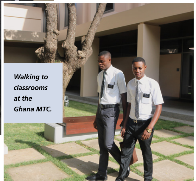
Walking to classrooms at the Ghana MTC.