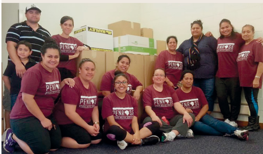
Relief Society sisters from Penrose stake donate and pack clothing for refugees.