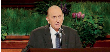
President Thomas S. Monson

missionary and be sealed for time and all eternity in the temple. It's not just my faith alone but also my companion's faith that strengthened our testimonies to bring up our five children in righteous ways.