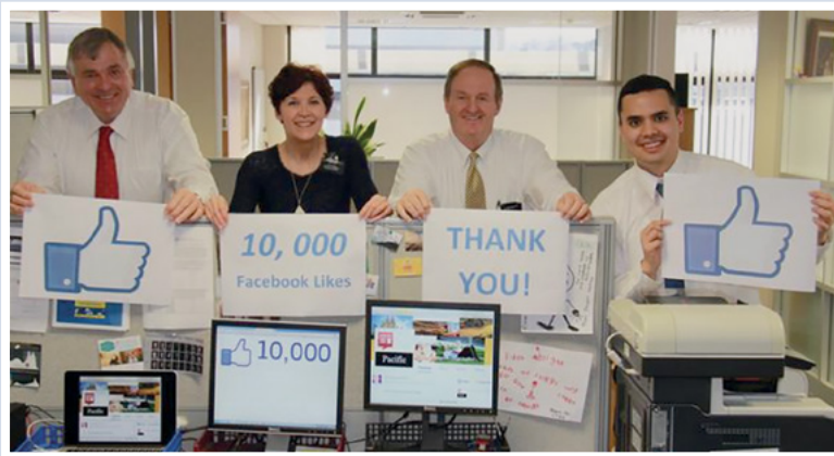
Newsroom staff at the Pacific Area Office celebrate having 10,000 fans.

Thumbs-up for the Pacific Mormon Newsroom Facebook page for reaching 10,000 fans.