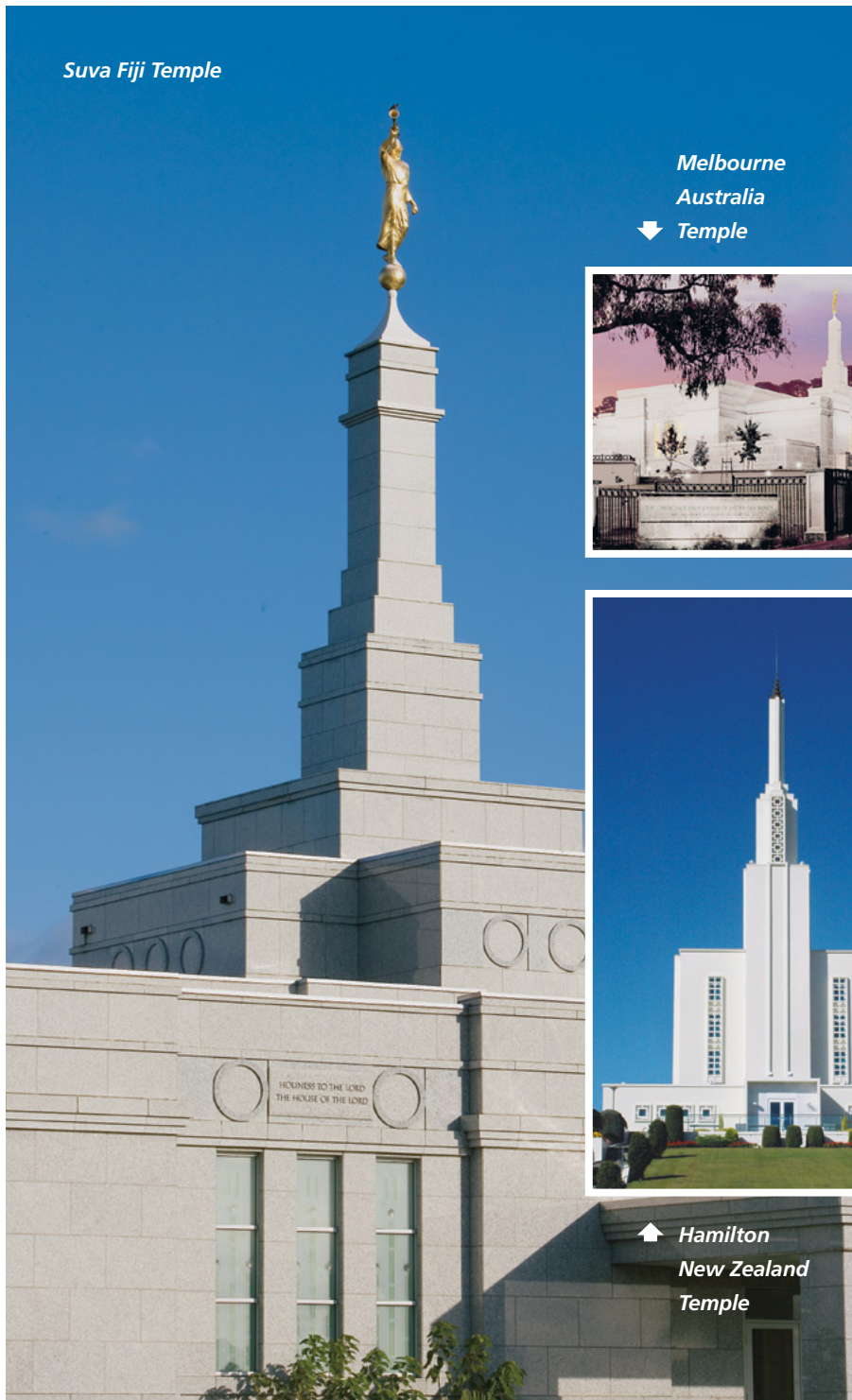
Suva Fiji Temple

In some cultures, it is not uncommon for an angry husband or wife to hit a spouse or a child. Others have endured significant verbal abuse. The proclamation on the family tells us those "who abuse spouse or offspring