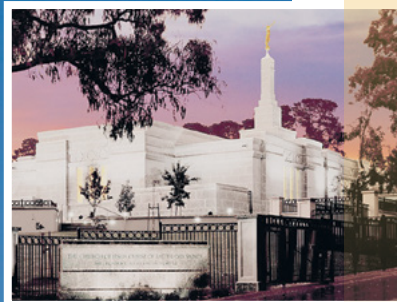
Melbourne Australia ↓ Temple