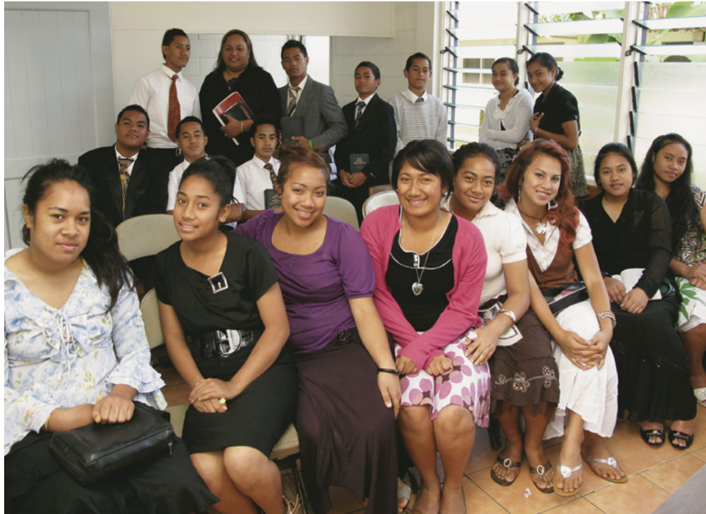
Church members in Tonga

This proclamation was read by President Gordon B. Hinckley as part of his message at the General Relief Society Meeting held September 23, 1995, in Salt Lake City, Utah.