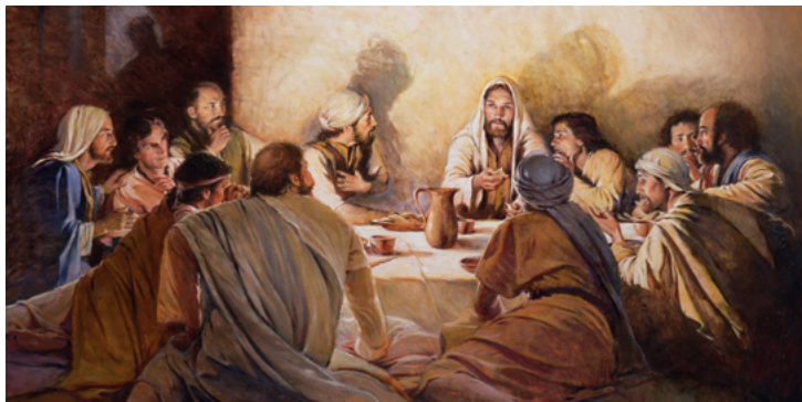
The Savior introduced the ordinance of the sacrament.

First, we partake of the sacrament in remembrance of the body and blood of the Son. Second, we witness unto God the Eternal Father that we are willing to take upon us the name of His Son and always remember Him. Beyond renewing our covenants, we are also committing to keep His commandments. Third, the sacrament service should be a spiritual experience inspiring us to remember Him, keep His commandments, and have His Spirit to be with us.