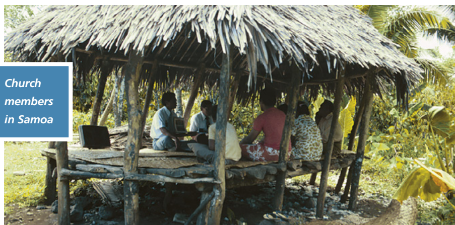
Church members in Samoa

He taught that on Monday evenings his family faithfully held family home evening. On Tuesday and Wednesday evenings he fulfilled his obligation to his employer, where he served as a top executive and controller. Thursday evening was reserved for his stake leadership responsibilities. Friday was reserved on his calendar for spending the evening with his wife. She could confidently schedule activities for them on that night. During the day on Saturday he attempted to spend time with his children in something that was non-Church related. Sometimes it was working around the house, a sport event in which they were engaged, or