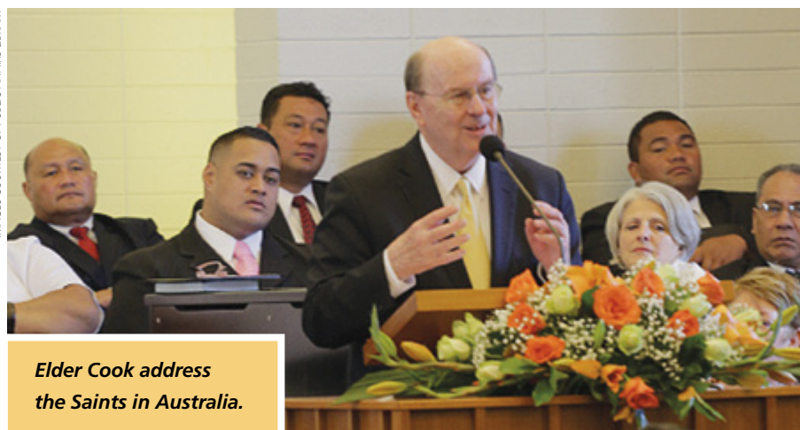
Elder Cook address the Saints in Australia.