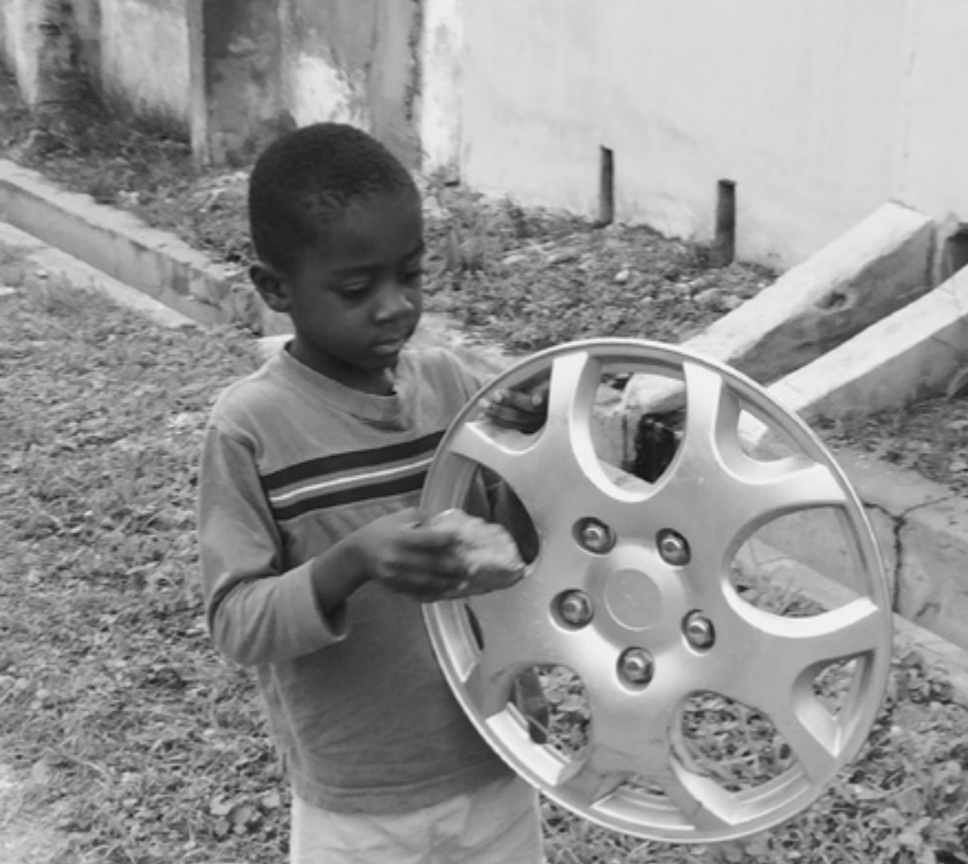
A large rock was used to hit a wheel cap to call everyone to church.

baptized. The wheel cap church had helped bring in those first African saints.