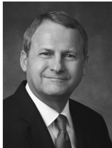
Elder LeGrand R. Curtis, Jr.

“And blessed are they who shall seek to bring forth my Zion at that day, for they shall have the gift and the power of the Holy Ghost; and if they endure unto the end they shall be lifted up at the last day, and shall be saved in the everlasting kingdom of the Lamb; and whoso shall publish peace, yea, tidings of great joy, how beautiful upon the mountains shall they be (1 Nephi 13:37). ■