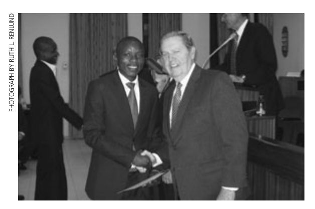
Elder Holland congratulates a new graduate of the Construction Trades Training.

care for the needy and render compassionate service. These principles bring blessings of safety, peace, beauty and prosperity.