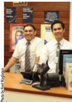
Be a good example to my family and the people around me is one goal I must work on in the coming year.

My commitment this 2013 is to work out my faith in the Lord Jesus Christ, and to improve my spirit and my testimony of the gospel. I will be a kinder person