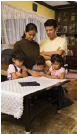
The priesthood in our home is behind every family prayer, family scripture study, and family home evening.

Our family life has been blessed in countless ways by the power of the priesthood. Through the priesthood authority our marriage was sealed for time and eternity. This promise anchored my husband and me in the gospel. It helped us direct our time and energy in making our family our top priority. As my husband honors the priesthood, he is able to receive divine help in providing for our spiritual and temporal needs. The priesthood in our home is behind every family prayer, family scripture study, and family home evening. These priesthood-directed activities and programs of the Church are our tools in fortifying our family against the evil that beset us now. I know that the blessings of the priesthood will continue to flow