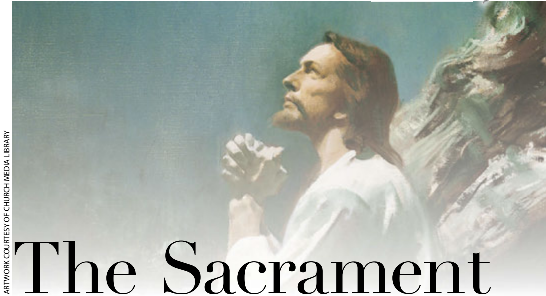
ARTWORK COURTESY OF CHURCH MEDIA LIBRARY