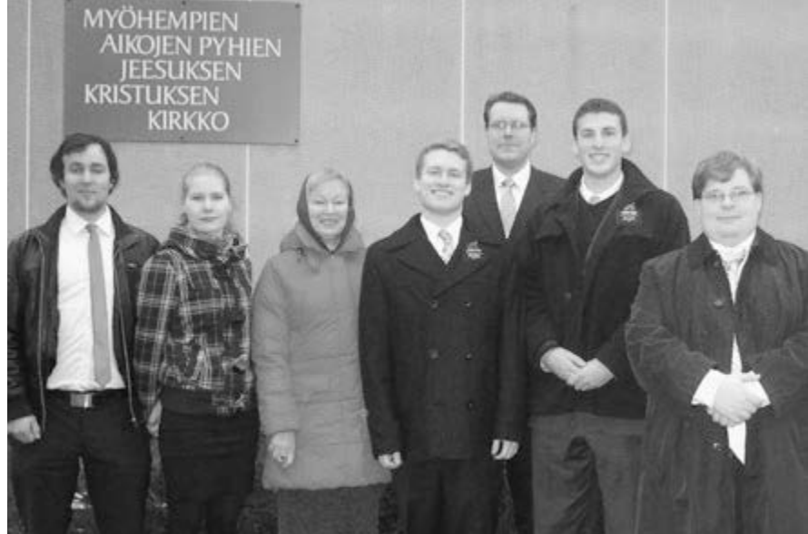
Pori Branch members and missionaries.