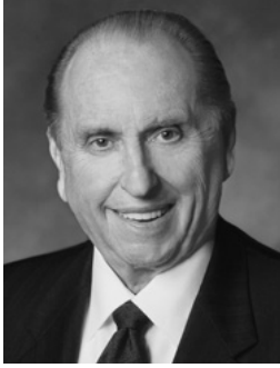
Seni Preseten Thomas S. Monson