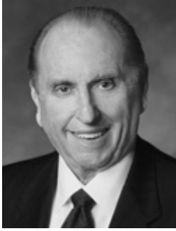
Seni Preseten Thomas S. Monson