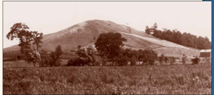
Ewe Chuken Cumorah a usun unungat mwain a nom etiwereun an Smith we atake non Palmyra, New York. Non an Joseph Smith fansoun ewe etiw a ponuno ren fetin ekkewe ira ra toropas ewe epek ese towaw seni asan ewe sassing: August 1907

I ewe chon nang a poputa ne fos ne esinengeni- I ei sefan usun an we aewin churiei ren met mi fis ren esap chok kona fesen non napanapen mettoch, ewe a fen wesino. I a iseni ngenie ren ewe watten netipeta seni nengita, fifiu won ketinas, samau mi efeiengaw, me iei ewe watten netipetan kapung epwe etto won ei fonufan non ei ew tapin muun aramas. Mwirin a apasa ekkei mettoch I a pwan etta sefan ngeni nang usun ia fen fori me mwan.