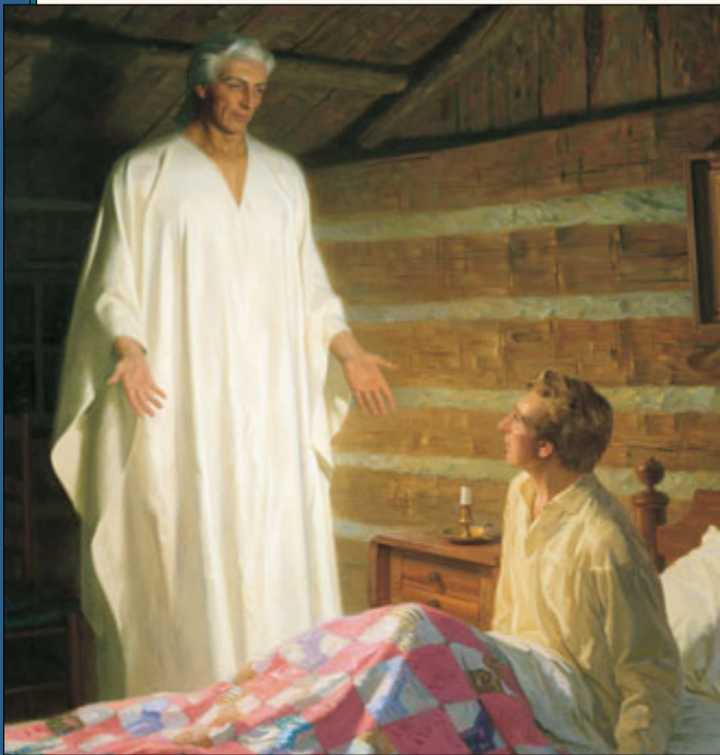
Unungat ier me mwirin An Joseph Smith Aewin Nemasepwi, Kot a tini ewe chon nang Moronai an epwe ngenir aurour ren an epwe eniwini sefani ewe kapas allim Jises Kraist.

Nupwen ewe fansoun ewe a interfiu nefinen ewe fansoun ua angei ewe nemasepwi me non ewe ier 1823— ua fen annuk seni au usap choni ekkewe tapin namanamen ewe ran, me fen ennetin pweteten ier, me pout-mwanino seni ekkewe ra fen chiechi me rafen foforoch ngeniei ika repwe assoneai ar repwe angei pungun ar achocho me ennetin atures ren napanapen wini sefan (seni annen fofor mwanin manaw). Ua fen nom nom chomm ongun sokkopaten sossot me pachengenir ne fiti sokkopaten mwich. Met a fis ren fansoun mwochomwoch Ua turunong non chommongen napanap mi mwan usun emon mi umes me anapanapen ewe woungawen serafo, me angangen emon aramas mi mwaken ewepung— ewe Ua netipengaw ren ai upwe apasa, a amwenienong non onononen sossot anetipengaw fan mesen Kot. Omusano ai upwe apasa, amwenir ngeni non onononen sossot. Non ai fori ei pwarata, ese wor emon a mochen nge Ua ekkeiki pwe ua tipis ren sokkun watten wesewesen ngawen ika ew afeiengawen tipis ew kinikinen.