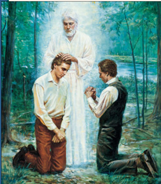
Joseph Smith me Oliver Cowdery ra angei ewe Pristut seni Aaron seni watten poun John ewe chon Papatais non May 15, 1829.

Joseph Smith me Oliver Cowdery mi chok sopweno ar angangen chiaku, nupwen ar fiti non ewe maram (May, 1829), ra fen nom won ekkoch ren ar no nein ekkewe ira ne iotek me angei emwen seni ewe Samol fiti sufen ni usun