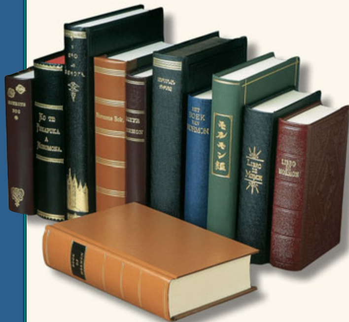
Ewe Puken Mormon a ewin mak non 1830, mi chok kan an for non chommong seni 80 kapasen unusen fonufan.

Ren chommong angang an Joseph Smith a kawesino ren porousen uruo, nengeni Joseph Smith—Uruon non ewe Pearl of Great Price ika History of the Church [Uruon ewe Mwichefel], 1:2–79.