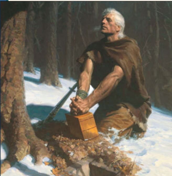
Non A.D. 421 ewe soufos Moronai a ireno ekkewe rekot mi pin rekotun aramasen kewe, a ireno won ewe Chuk Cumorah. A niwin sefan mwirin usun ewe manaw sefan I a ureni Joseph Smith usun rekotun noom ewe a masou ren ewe unusochun ewe kapas allim usun a etto seni ewe Chon Amanau ngeni aramasen noom ren ewe fonuen Amerika. Ewe rekot iei ewe Puken Mormon.

Non kapachettan ngeni ekkei oseni I a apasa seni ewe engon me ewin sopun seni Isaiah a apasa pwe epwe mwitir chok unusochuno. I a apasa pwan seni ewe aunungatin sopun non Fofor, 22 me 23 uokisin, a nonom usun non nouch Testamen mi Fo. Ia apasa pwe ewe soufos afen Kraist; nge ewe ran ese muo waretto nupwen usap ausening ngeni ewe soufos repwe imuseni noun ewe Samol aramas.