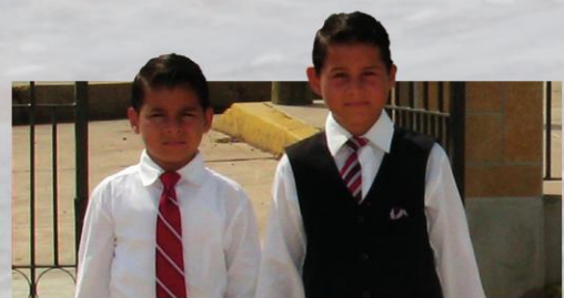
These brothers hope to live up to the names that their parents gave them. They want to be just like Mahonri and Helaman from the Book of Mormon.