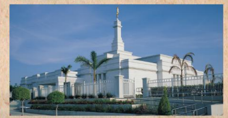
The Guadalajara Mexico Temple is the 11th of 13 temples in Mexico.