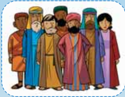
People of Nineveh