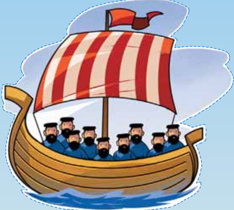
Ship to Tarshish