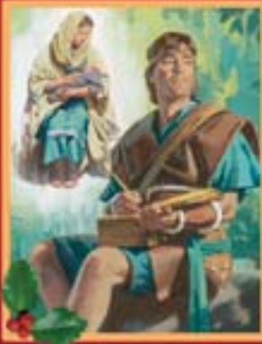
1 Nephi 11:13–21

Note: If you do not wish to remove pages from the magazine, this activity may be copied, traced, or printed from the Internet at www.lds.org . Click on Gospel Library.