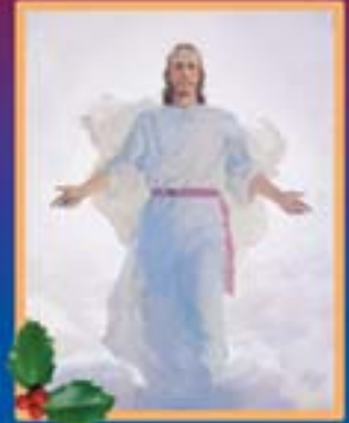
Matthew 24:30, 36