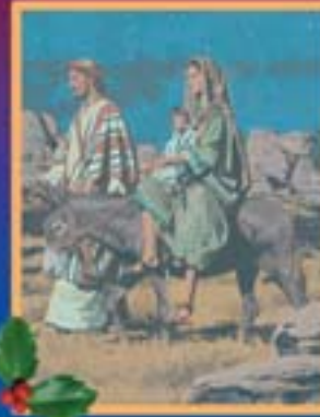
Matthew 2:13–15, 19–23