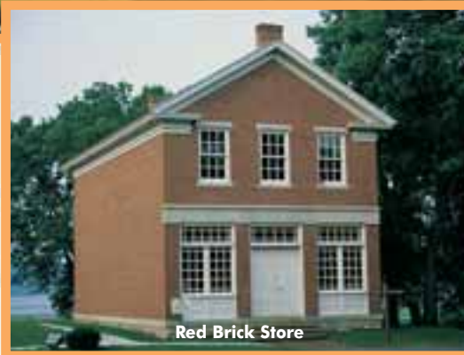
Red Brick Store

Joseph Smith and his brother Hyrum were arrested on false charges and put in jail in Carthage, Illinois. On