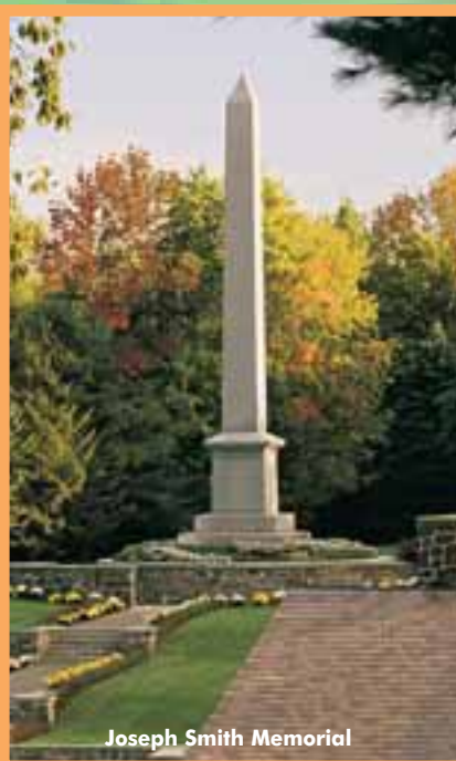
Joseph Smith Memorial