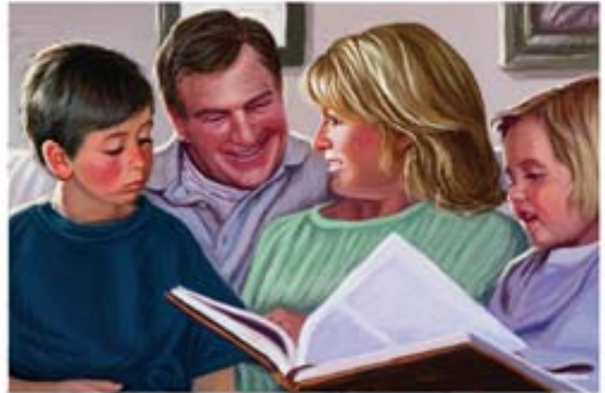
Study the scriptures by yourself and with your family.

W hen people are baptized and confirmed, they become members of The Church of Jesus Christ of Latter-day Saints. They begin a journey back to Heavenly Father and Jesus Christ. There is another journey that children under age eight need to take—the journey of preparing to be baptized.