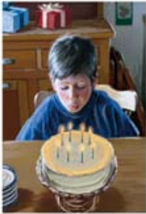
Happy eighth birthday!