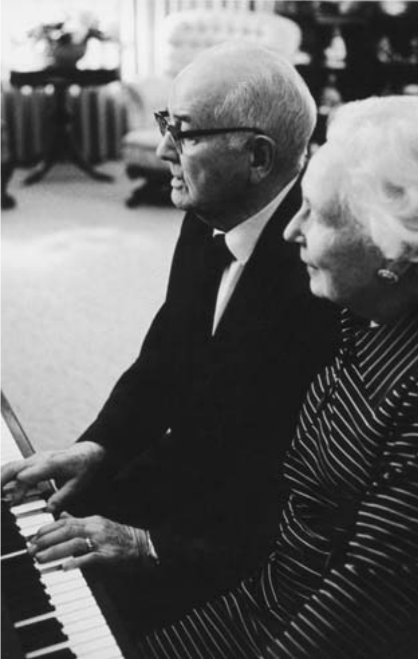
“Camilla has been by my side in every experience.”