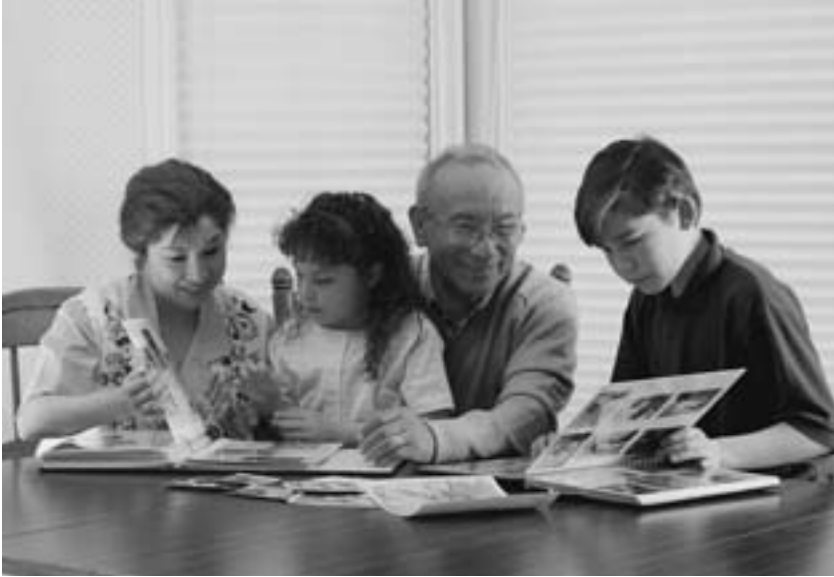
President Kimball taught that the Sabbath is a day "to visit quietly with the family."

Then we can hope for the blessings promised the children of Israel: "Ye shall keep my sabbaths, and reverence my sanctuary: I am the Lord.