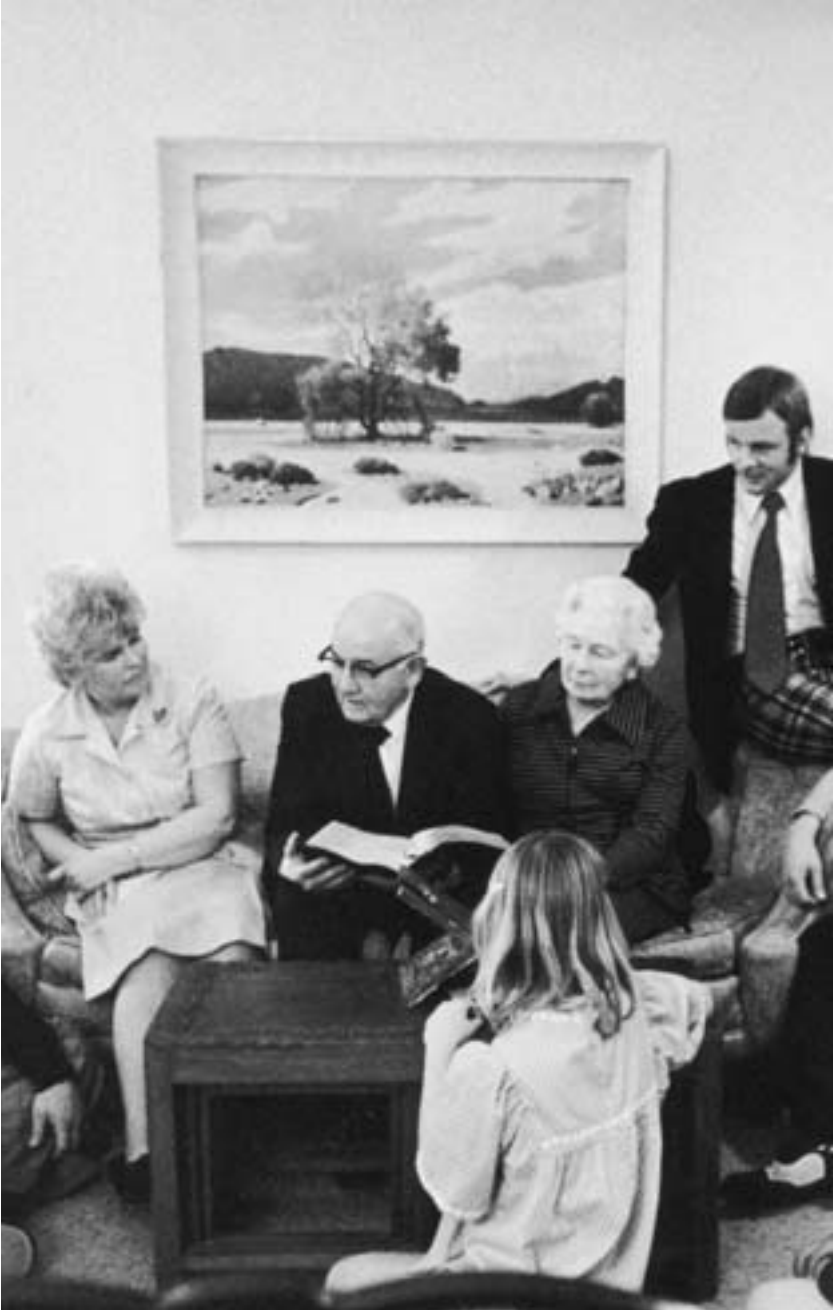
President and Sister Kimball with members of their family.