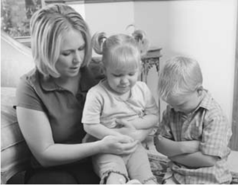
“Behavior learned at home determines behavior in Church meetings.”

meeting begins, and that sits together to listen to the prelude music and put worldly concerns out of their minds.