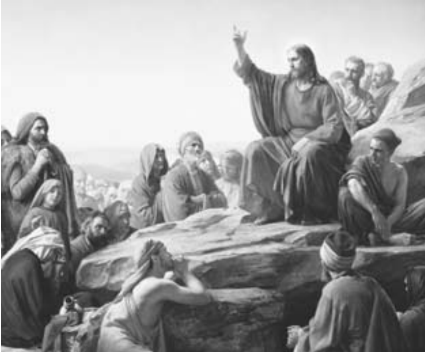
Jesus Christ taught, "If ye forgive men their trespasses, your heavenly Father will also forgive you" (Matthew 6:14).

tinue to disbelieve the other's sincerity. This is sin, for when a reconciliation has been effected and when repentance is claimed, each should forgive and forget, build immediately the fences which have been breached, and restore the former compatibility.