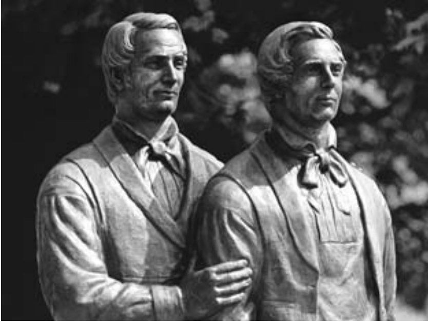
The martyrdom of Joseph Smith, who was killed with his brother Hyrum in 1844, “is another of the infallible proofs of the divinity of the gospel of Jesus Christ.”

And his hour had come to seal with his blood his testimony, so often borne to multitudes of friends and foes. . . .