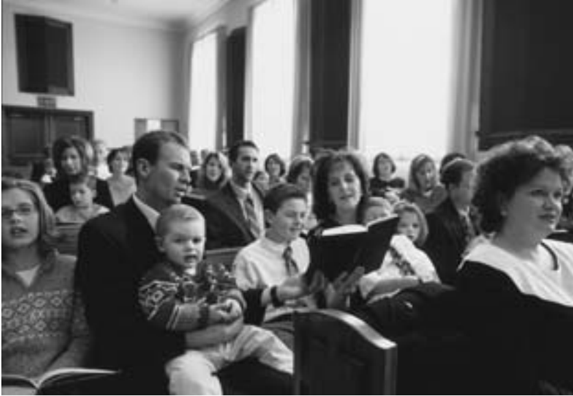
President Kimball taught that “faith is born, rekindled, and sanctified” in Latter-day Saint chapels.

temples erected unto the Lord, should be a place of reverence to Him. (See D&C 109:13, 16–21.)