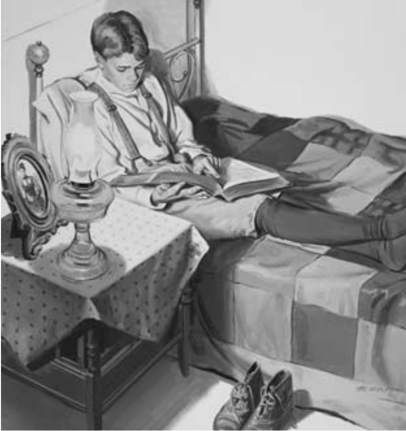
As a young man, Spencer W. Kimball determined to read the entire Bible.

Genesis, first chapter and first verse, and I read well into the night with Adam and Eve and Cain and Abel, and Enoch and Noah and through the flood even to Abraham.” 1