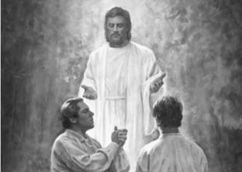
As part of the Restoration, the Prophet Joseph Smith and Oliver Cowdery received the Aaronic Priesthood from the resurrected John the Baptist.