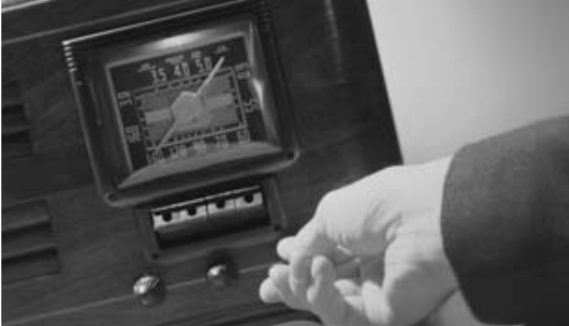
President Kimball compared faith to tuning a radio.

involved. He may turn darkness into light by pushing a button and read in the darkest night. He need not be able to develop the electricity, nor to have the knowledge to wire the home. But he must have the faith sufficient to secure lamps and faith to turn the switch. He then may receive the light. . . . He may turn a dial and enjoy sweet music from afar without being able to fashion a radio or understand fully its workings, but the blessing will never be his unless he connects his set with the power, and turns the dial correctly. In like manner, one may receive spiritual blessings and manifestations, by establishing contact turning the dial. Faith manifested by prayer and works is that key. 3