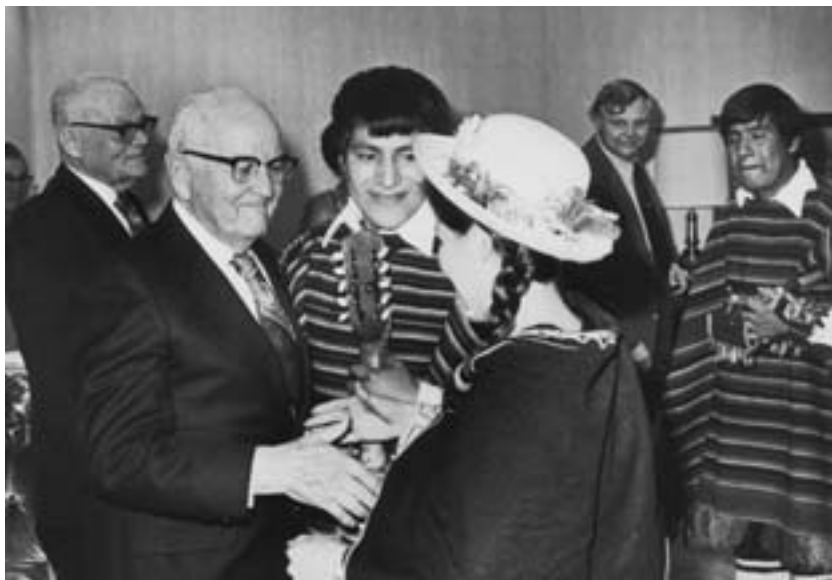
President Kimball said, "I would like to be known as one who loves his brothers and sisters."

he served as an example of moving forward in the Lord's service, no matter what the obstacles.