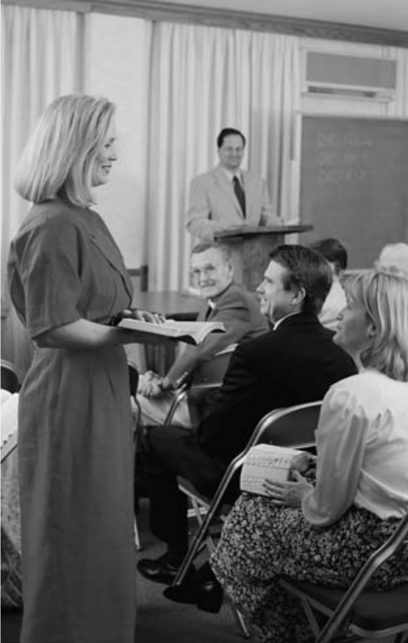
“Call the sabbath a delight, the holy of the Lord” (Isaiah 58:13).