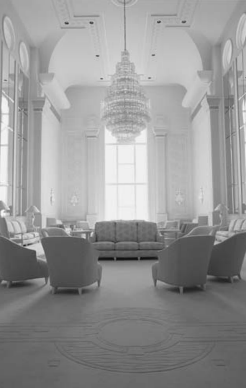
Celestial room in the Mount Timpanogos Utah Temple. President Kimball taught that the temple “should be a place of reverence.”