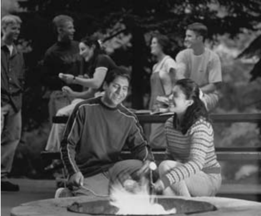
President Kimball gave clear guidelines for young people who date.