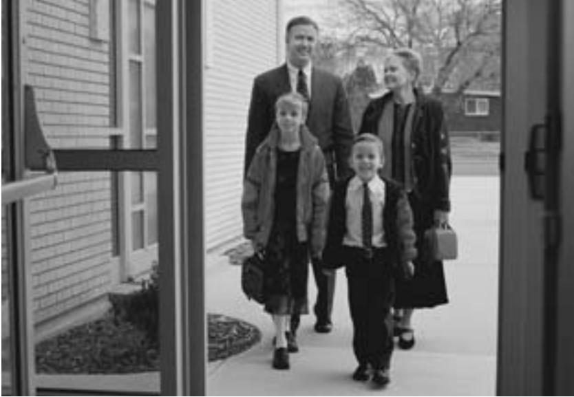
The Sabbath "is a day in which to worship and to express our gratitude and appreciation to the Lord."

locked and business postponed, and troubles forgotten; a day when man may be temporarily released from that first injunction, "In the sweat of thy face shalt thou eat bread, until thou return unto the ground. . . ." [See Genesis 3:19.] It is a day when bodies may rest, minds relax, and spirits grow. It is a day when songs may be sung, prayers offered, sermons preached, and testimonies borne, and when man may climb high, almost annihilating time, space, and distance between himself and his Creator.