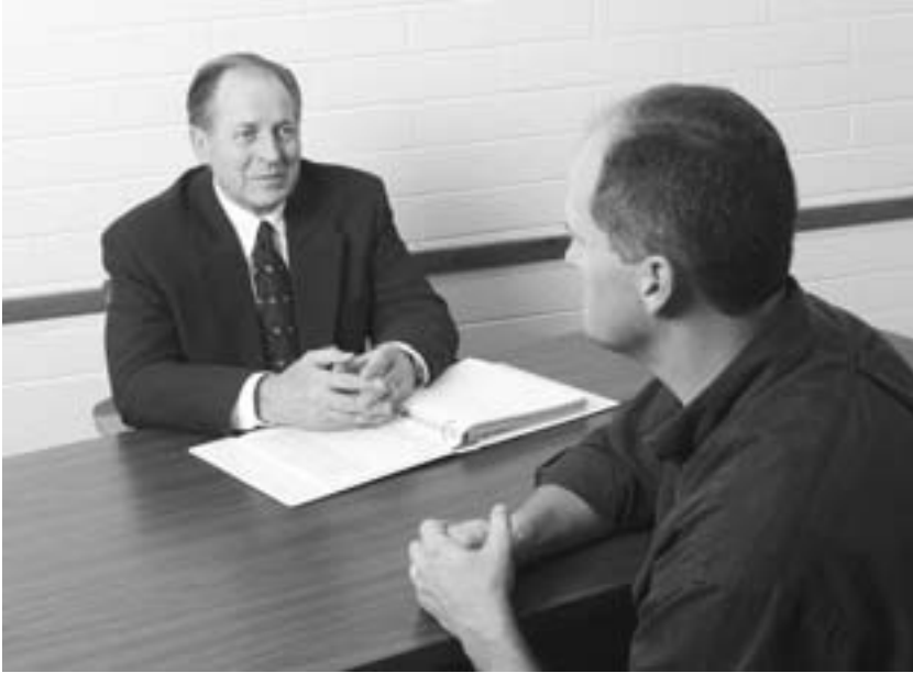
“Confession brings peace.”

In abandoning evil, transforming lives, changing personalities, molding characters or remolding them, we need the help of the Lord, and we may be assured of it if we do our part. The man who leans heavily upon his Lord becomes the master of self and can accomplish anything he sets out to do, whether it be to secure the brass plates, build a ship, overcome a habit, or conquer a deep-seated transgression. 14