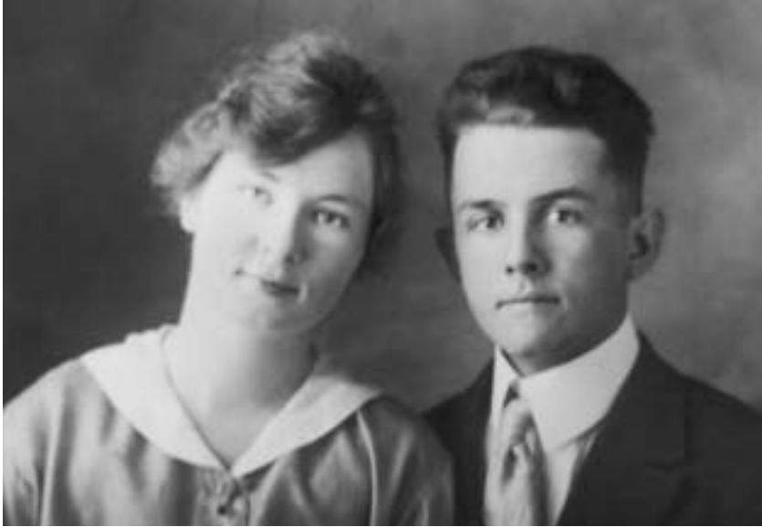
Camilla Eyring and Spencer W. Kimball near the time of their wedding.

her on the bus, where they continued to talk, and he received her permission to call on her.