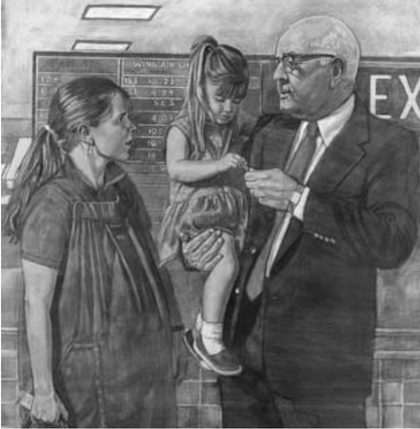
President Kimball's simple act of kindness in a Chicago airport had far-reaching effects.

be fine. He went on his way. About a week later I saw a picture of Apostle Spencer W. Kimball and recognized him as the stranger in the airport.’” 2