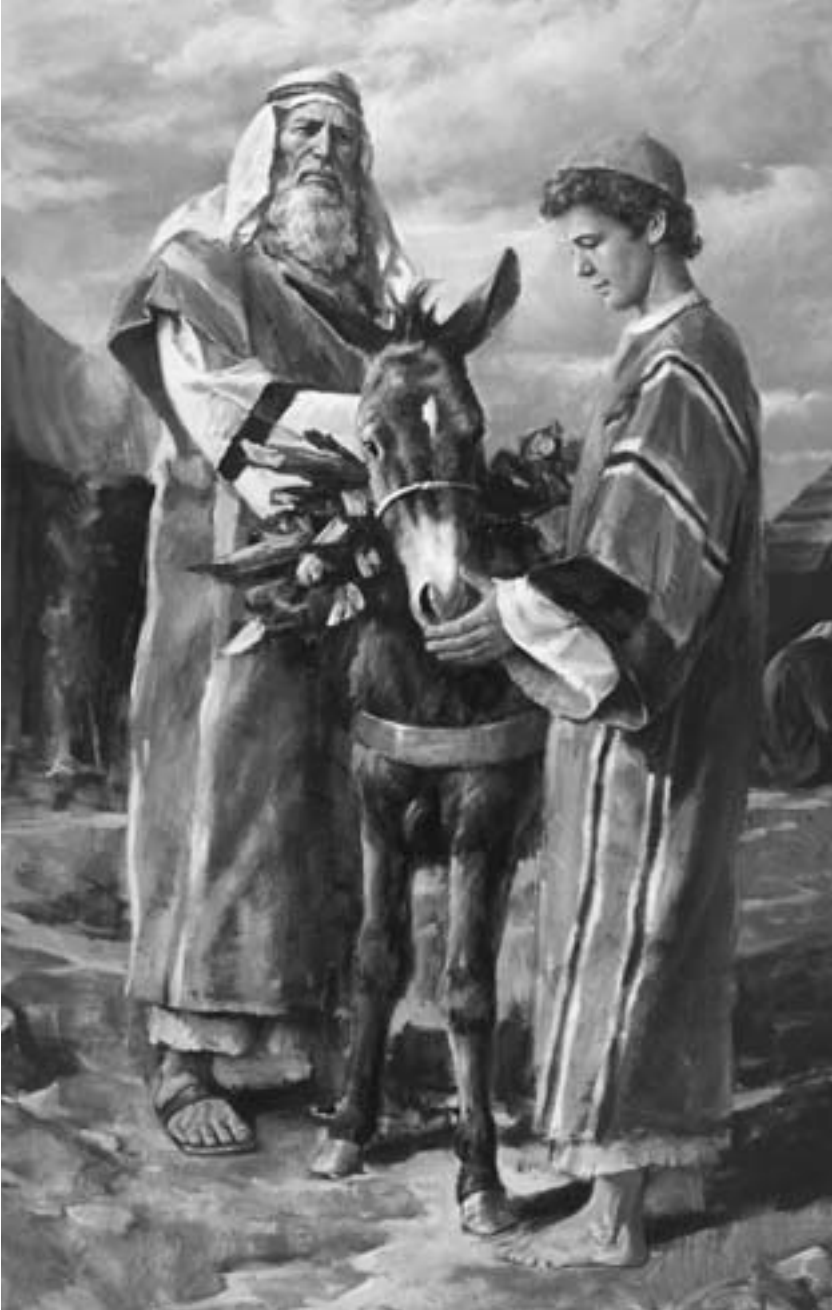
Abraham showed “exceeding faith” when he responded to the “test [that] was applied to him.”