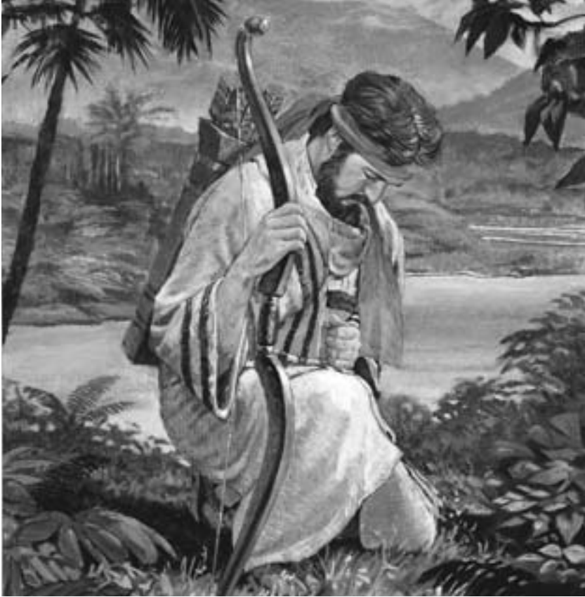
Like Enos, we will find that revelation often comes quietly, without spectacular manifestations.

you will find the Lord speaks. He spoke to Isaiah, to Jeremiah, and others, but those were not always personal appearances. It was much like Enos's experience, for as you read in the book of Enos in the Book of Mormon, he had been fasting and praying and was reaching and asking for information and for a forgiveness of his sins particularly: "And while I was thus struggling in the spirit, behold, the voice of the Lord came into my mind again, saying: . . ." (Enos 1:10.) In that manner, many, many of the revelations have come.