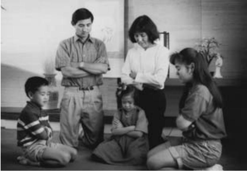
Family prayer “is a forward step toward family unity and family solidarity.”

which will generally be the father who holds the priesthood, but in his absence the mother, and in their absence the oldest child present. 14