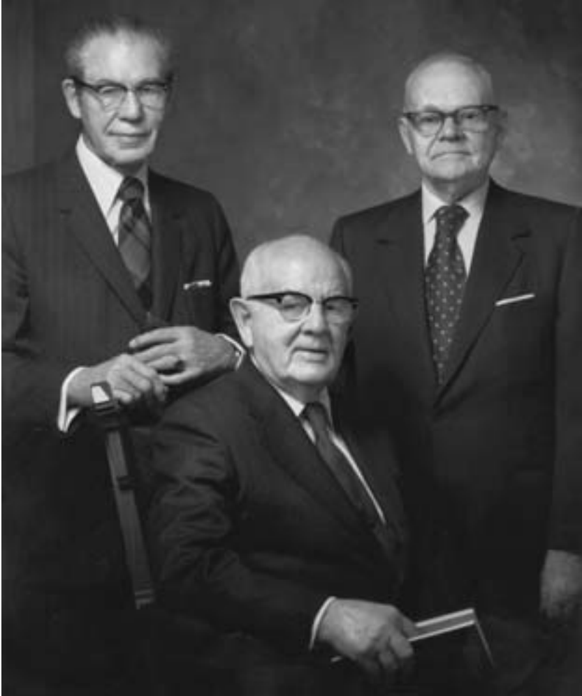
President Spencer W. Kimball, center, with his counselors in the First Presidency from 1973 to 1981: Presidents N. Eldon Tanner (left) and Marion G. Romney (right).

President Kimball's address on that occasion sounded a central theme of his ministry as President of the Church: