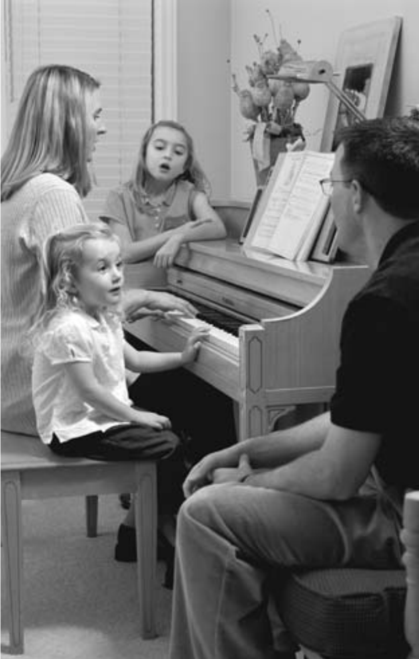
As suggested by President Kimball, the chorus of "I Am a Child of God" ends with the words "Teach me all that I must do to live with him someday."