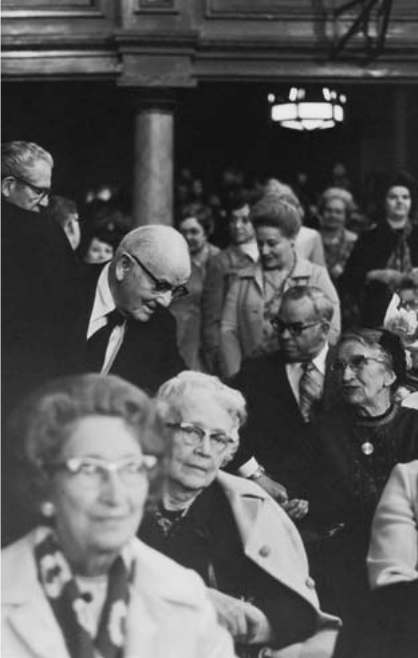
President Kimball greets people as he enters the Salt Lake Tabernacle for general conference.