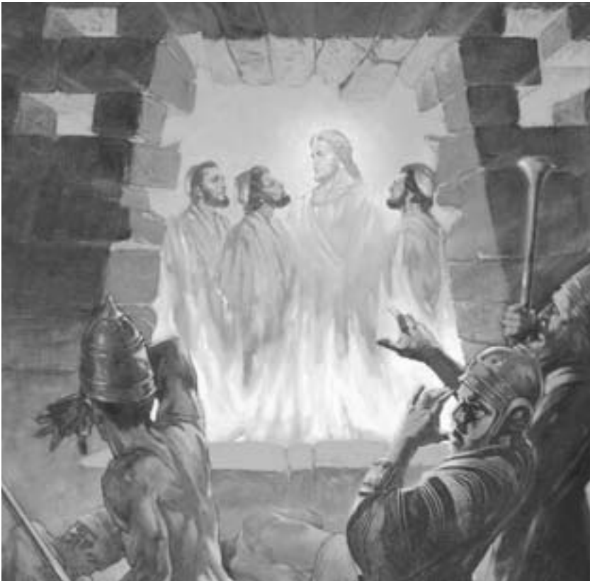
Shadrach, Meshach, and Abednego “faced the fiery furnace rather than deny their God.” The Lord delivered them from the fire.

. . . When the prearranged sounds of the cornet, flute, harp, and other instruments reverberated through the area and the masses of men and women everywhere filled their homes and